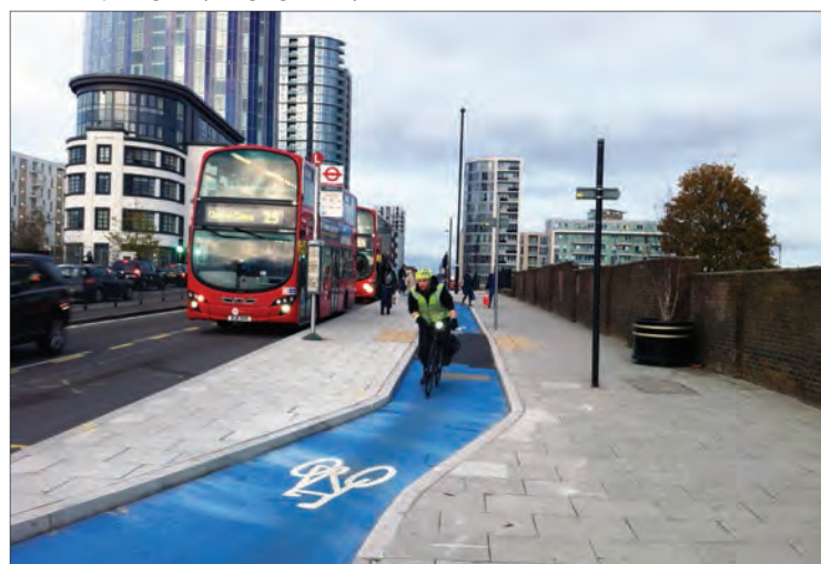
Figure 3: Near Stratford, the newest generation of bicycle superhighways segregate bicycle and bus traffic.

An important caveat to keep in mind, when thinking about whether these sort of effects could be achieved by similar policy interventions in other cities, is that London is an ancient city with good bones to build on. Its core, inside the charged area, still has pedestrian-scale streets laid out by the Romans 2,000 years ago and during medieval times. During the Victorian era, a dense railway network was developed, including fifteen rail stations and the first ten lines of the Underground system. These stations and right of ways have been in near-constant use, or redeveloped to meet changing needs, over the past 150 years. London's highly transit accessible center helped it develop into a monocentric city where employment is concentrated in the central business district. So we are at a disadvantage in a lot