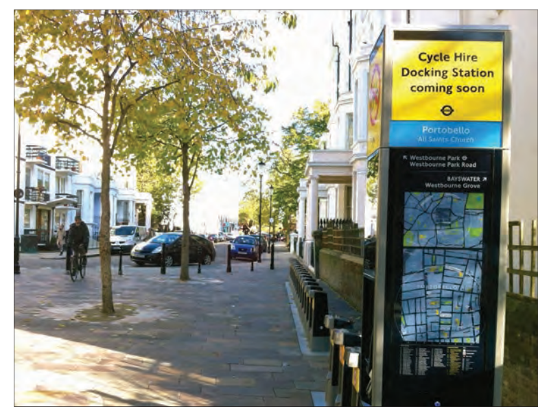
Figure 4: In Notting Hill, a street was closed to divert traffic and create a pedestrian plaza with a bikeshare station. The sign is an example of the Legible London wayfinding system.

Finally, London's willingness to experiment has helped it remain nimble and responsive to rapidly changing conditions as volumes of bicyclists and pedestrians increase. Installing