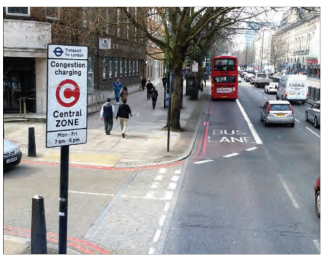
Figure 1: The congestion charge boundary on Euston Road, where two of six lanes are dedicated for bus priority.

A similar calculation may be done for the change from 2002 to 2009, but in this case people were clearly switching to bicycles