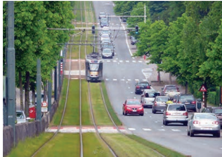
Figure 1: The Eco-Track at Lincoln and SW 3rd Avenue may resemble this track in Belgium.

Two important decisions had to be made regarding the orientation of the light rail path. First was the placement of the bridge. To facilitate this decision, the Willamette River Crossing Partnership Committee was created and consisted of former Portland Mayor Vera Katz and project partners and institutions, businesses and neighborhood representatives from both sides of the river. In May 2008, the committee recommended the current alignment, which begins at OHSU's future South Waterfront campus and then crosses the river to the east bank to SE Sherman Avenue near the Portland Opera rehearsal and administrative space.