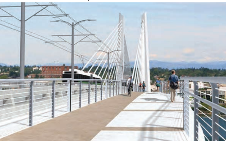
Figure 3: Artistic rendering of the future PMLR bridge across the Willamette River.

Regions that have the need and capacity for increased public transit options, and a public who is willing to support such endeavors, can benefit immensely from projects such as the PMLR. Although light rail was ultimately decided upon as the Locally Preferred Alternative, a variety of transit options are available to other communities—including bus way expansion, bus rapid transit, river transit, high occupancy vehicles lanes, and high occupancy toll lanes. Any proposed transit project should be evaluated for its efficiency of operation, quality of service provided, level of expected ridership, projected economic benefit, and alignment with the community's land use plans. Cities looking to expand existing light rail services to previously underserved areas, create new customer bases for their downtown core, reduce traffic congestion for commuters, and stimulate their local economy should consider a project similar to the PMLR.