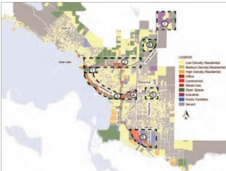
Figure 1: Proposed General Plan for Clearlake.

General Plan Update, such as land use, whose main goals are as follows: