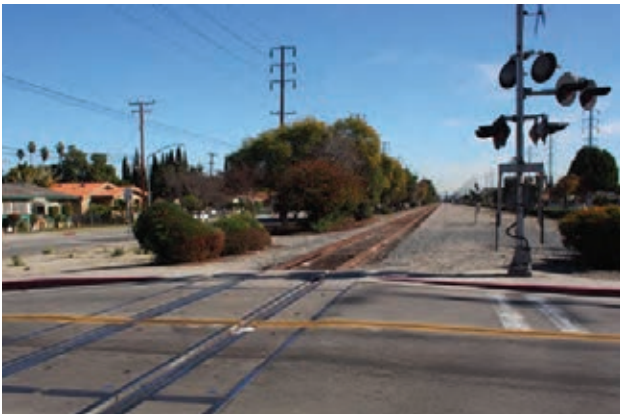
Figures 4 & 5: Existing rail’s Right of Way in Bell, and an example of the proposed design for rail-trail separation.

The project would create an east-west bicycle and pedestrian linkage between the City of Huntington Park neighborhood to the north, the City of Maywood neighborhood to the west, and several neighborhoods in the cities of Bell Gardens and Commerce to the east. The project proposes using the existing ROW between 80-120 feet in width to develop the active trails (Figure 5). Creating this trail responds to the city’s need for more parks and open space. This project builds on the national movement of utilizing underutilized Right of Way for multiple use purposes.