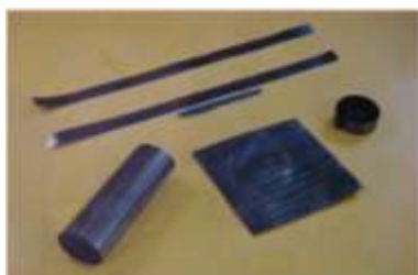
Fig. 2 – Flexible Graphite tapes and foils

The exfoliated graphite sheet was produced from unique thermo-chemical treatment of natural graphite flakes. The process flow chart for exfoliation of graphite is shown in Fig. 1. In this process, the graphite expands almost 300-350 times of its original volume and takes the shape of worms. These worms can be pressed or rolled into any desired shape without any binder. The compression or rolling of exfoliated graphite particles give a flexible sheet which is usually named as flexible graphite foil. The sheet is having an excellent salient features such as impermeable to gases and fluids and can be used from -200 to +500 °C in the oxidizing atmospheres and up to 2500 °C in the non-oxidizing atmosphere or vacuum. It cannot be wetted with molten glass, metals etc. It offers high anisotropy in electrical and thermal conductivities. It exhibits excellent temperature shock resistance. It does not age or creep. It is self-lubricating and can be easily cut and punched. It is resistant to radiation doses of any magnitude occurring in nuclear power stations. The obtained graphite worms are pressed and rolled into graphite sheets and tapes as shown in Fig. 2.