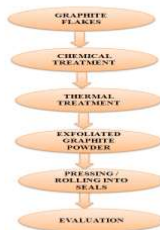
Fig. 1 – Process flow chart of exfoliated graphite product

The surface area of exfoliated graphite sheets has been obtained using (11-2370) Gemini, Micromeritics, USA, surface area analyzer at a regeneration temperature of 200 °C for 2 h with N 2 purging.