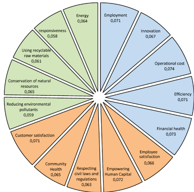
Figure 3 Sustainable WCM model [3]

obtained through obtaining the boundary super matrix and its defuzzification by the gravity center method (Tab. 9).