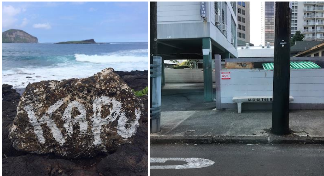
Figure 12 "Kapu" Near Makapu'u Beach, July 2017

Stevenson’s description of the “anonymous care” of suicide prevention, as care in Hawaii is anything but depersonalizing. The purpose is to actually know those with whom you’re interacting, rather than minimizing familiarity in these encounters. Following this, the final section of this chapter illustrates the complexities of aloha as a form of care and explores some of the contradictions and instabilities inherent within it.