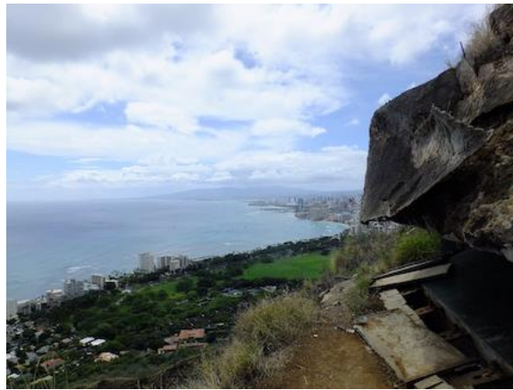
Figure 3 Honolulu Viewed From Diamond Head Crater, May 2014

Hawaii. These narratives, split into three parts, each link back to recurring themes from my conversations with informants regarding issues of youth mobility, economic strain, homelessness and housing, and the clash that exists between Hawaii’s “postcard image” and the reality of some of its domestic issues, many of which are hidden in plain sight.