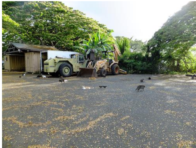
Figure 7 Feral Cat Shelter Parking Lot, Near Kualoa, May 2014