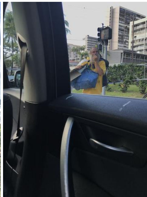
Figure 9 Homeless in Honolulu From A Taxi Window (April 2019)