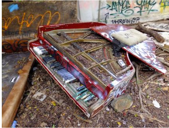
Figure 6 Grand Piano in Abandoned Old Estate, outside of Kailua, September 2015