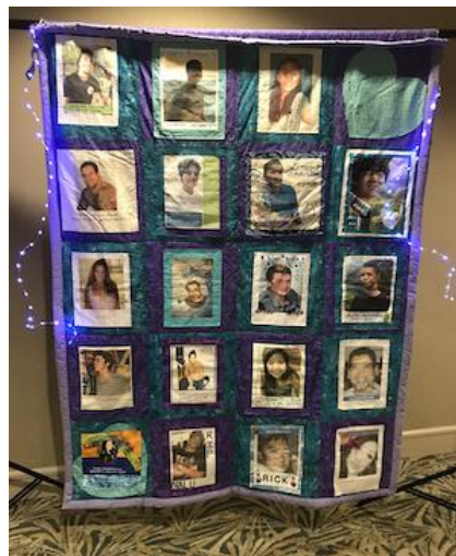
Figure 1 Honolulu, HI - “Memory Quilt,” 2016

As we turned the first bend of Magic Island, people raised signs above their heads with the names, ages, and faces of lost loved ones and phrases of support for those struggling. I couldn’t help but feel confused at what I was witnessing. For an event that was meant to bring public attention to the problem of suicide among Hawaii’s communities, the couple hundred people in attendance were walking in almost total isolation from the public. Rather than being seen or heard, their messages of hope and tragedy faced the uncaring waters of the ocean, not a soul in sight to receive them.