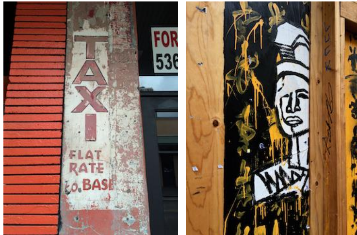
Figure 4 Old Taxi Sign, Chinatown, Honolulu HI, September 2015

featuring survivors of loss. This has also historically reflected the larger U.S. model of grassroots engagement in community mental health care as being the result of volunteer and survivor efforts (discussed in section 1.x). In the following section, I introduce and situate Hawaii’s primary venue for preventative suicide care: the Task Force model.