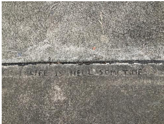
Figure 10 "Life Is Hell Sometimes," Campus Sidewalk, May 2014

without any affective ties at all—and sometimes it's both of these things together. Moreover, the associations scholars frequently make between being a volunteer and/or having an affective reason to care do not automatically establish care work as something that is also not legitimized. As those in this chapter illustrate, being a subject and provider of care frequently blurs the space between paid and volunteer work, personal experience and professionalization. Perhaps this blurring is what makes narratives of care worker experiences so powerful and their care so consequential.