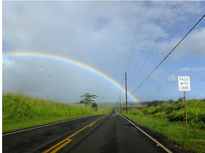
Figure 2 North Shore, Oahu, HI - “Pass With Care” Road Sign, September 2015

I present these narratives of care in order to ask whether we might benefit not simply from valuing more holistic, subjectively-informed approaches to caring for the suicidal, but whether it might become possible, within mental health care systems more broadly, to care non-reciprocally, without bias, and with a greater urgency—with aloha .