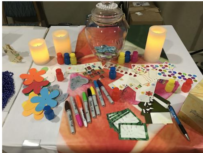
Figure 14 Healing Crafts Table, Suicide Prevention Conference, Waikiki, April 2019