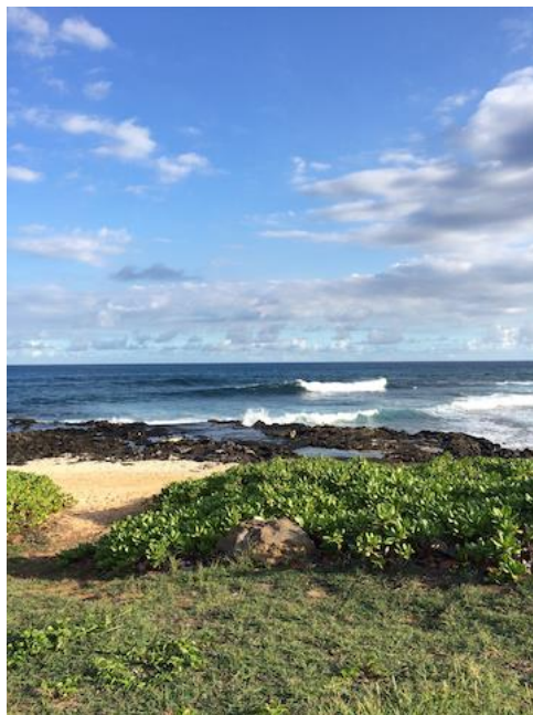
Figure 8 View of Sandy Beach (Where I Met Martin) (2015)

tourists would stumble across a homeless camp in the woods than on a crowded beach. “It’s too risky to be out here. You go out to do your business in the ocean, you come back and your stuff’s being hauled away.” With the constant interest of the state to maintain tourism, Sandy Beach needed to uphold its reputation as a hang-out destination, not as a “homeless beach.” But just like the sweeps in downtown Waikiki, it was all about visually concealing a problem. There was no solution, the men told me: no one cares if you’re homeless, as long as you can’t be seen. It was true that no one seemed to be paying much attention out beyond these public spaces. In a sense, the cost of living homeless in Hawaii seemed to be what you could get away with hiding in plain sight.