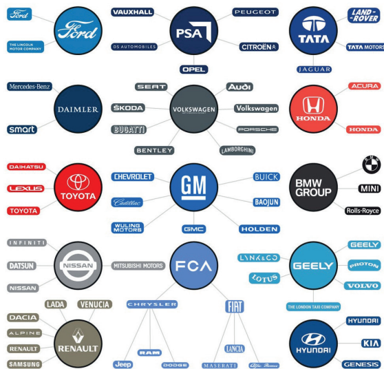
Figure 3. Automotive manufacturer groups [3]

Amongst the top manufacturer companies, Toyota has a market share of approximately 10%, according to Figure 2. This significant market share resulted in 260 billion USD revenue in 2017 [3]. On Figure 3, the automotive action groups are shown, to which the companies of Figure 2 belong.