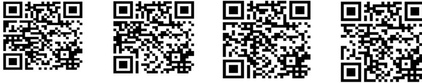
Fig. 2. Sample of QR codes for screencast video online.