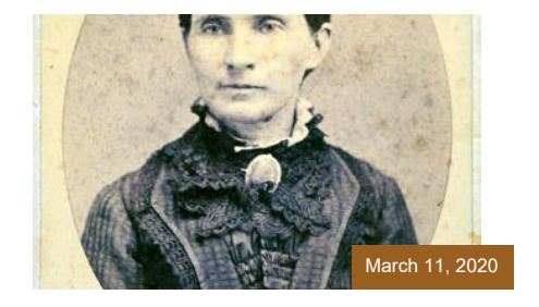
More from Texas