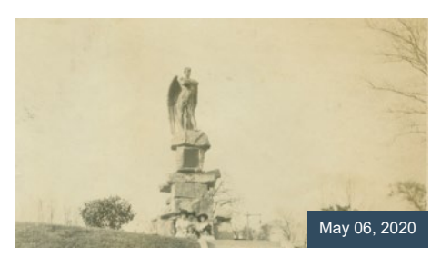
More from The Public Historian

Making History: Houston's "Spirit of the Confederacy"