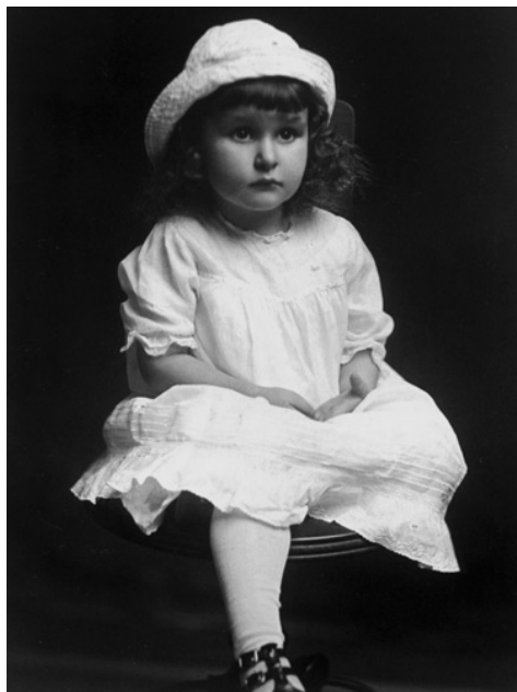
Lady Bird, 1915