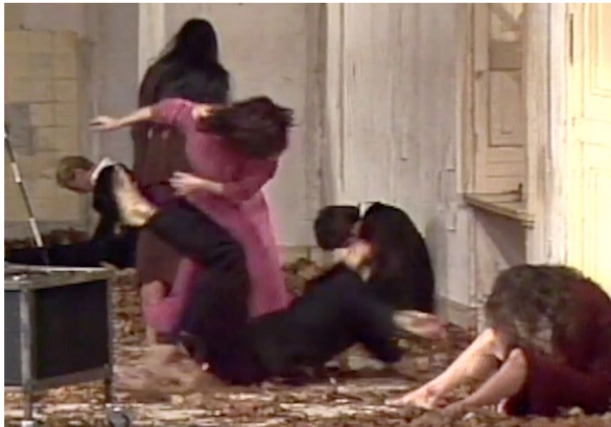
8 Pina Bausch, Bluebeard. While Listening to a Tape Recording of Béla Bartók's opera "Duke Bluebeard's Castle" , performed by Tanztheater Wuppertal, https://vimeo.com/338870708

My working with preexisting narrative and the intersections of performance art and dance has turned my attention to the works of the late German choreographer Pina Bausch, and specifically her