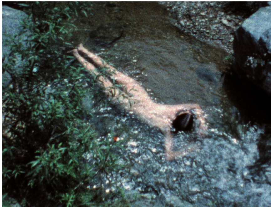
2 Ana Mendieta, Creek , super 8 film, color, silent, 1974

The performance is a visceral experience for myself or my performers. It is often private or presented to a small audience. In Luncheon on the Rocks (fig. 1), I laid on the downward slope of a rock slide. My body was strewn across boulders, as if fallen and unconscious, but perfectly placed atop a picnic blanket. The performance consisted of five-minute segments of meditative performing and filming, where I remained mostly still with some small, subtle movements. It was a live cinematic tableau for passing hikers to stumble across. During the performance I was only aware of my camera watching and recording me on its tripod. I was unaware when other eyes were on me, but to them I was only a red dot in the distance. The work is now represented by photographs: three stills extracted from the video footage. It is an iteration of the live component and can be accessed by a wider audience.