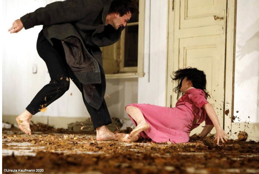
7 Pina Bausch, Bluebeard. While Listening to a Tape Recording of Béla Bartók's opera "Duke Bluebeard's Castle", performed by Tanztheater Wuppertal