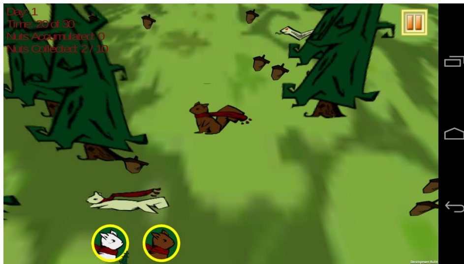
Figure 4 Enemy Spotted - Snake