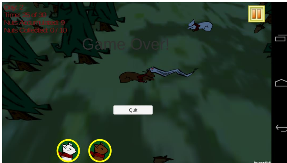
Figure 8 Game Over from snake killing both squirrels