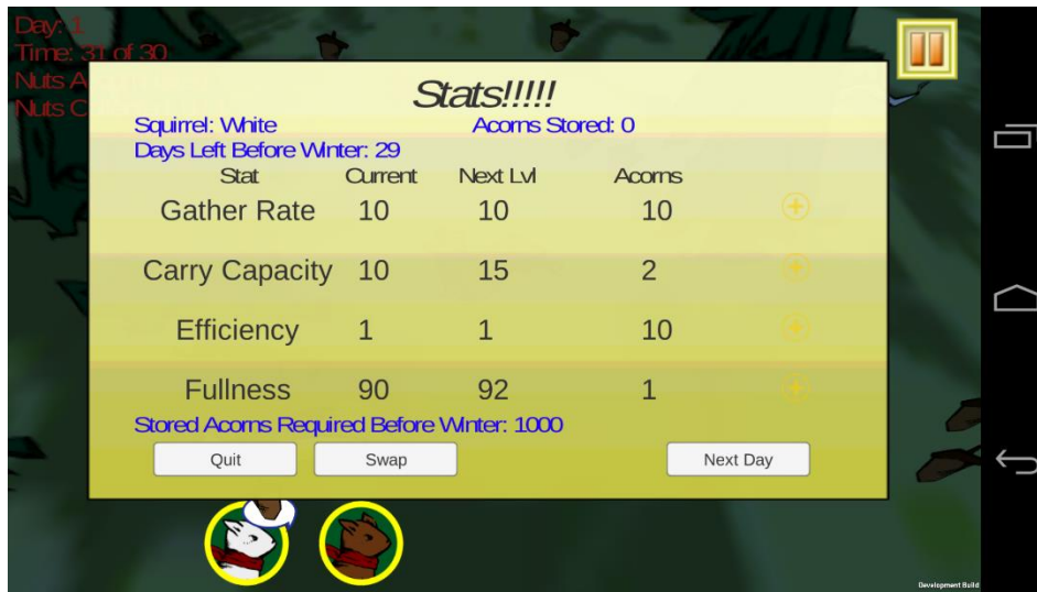
Figure 7 Stat Score Screen