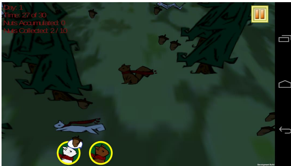
Figure 6 Still avoiding the snake at night and white squirrel has finished gathering from trees