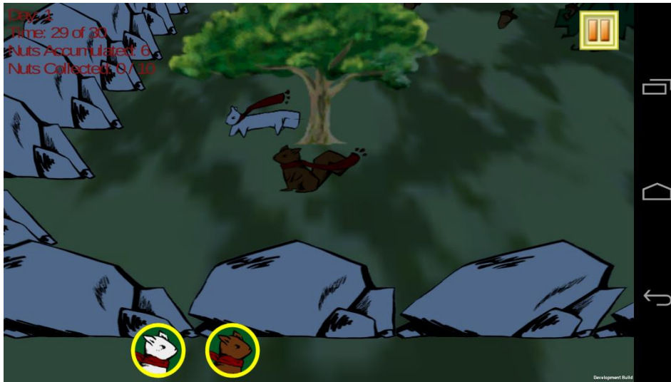
Figure 5 Lights Changed to Night