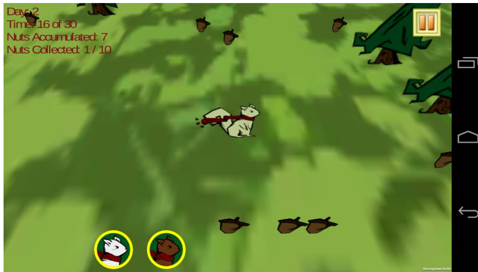
Figure 3 Lights Changed to Afternoon