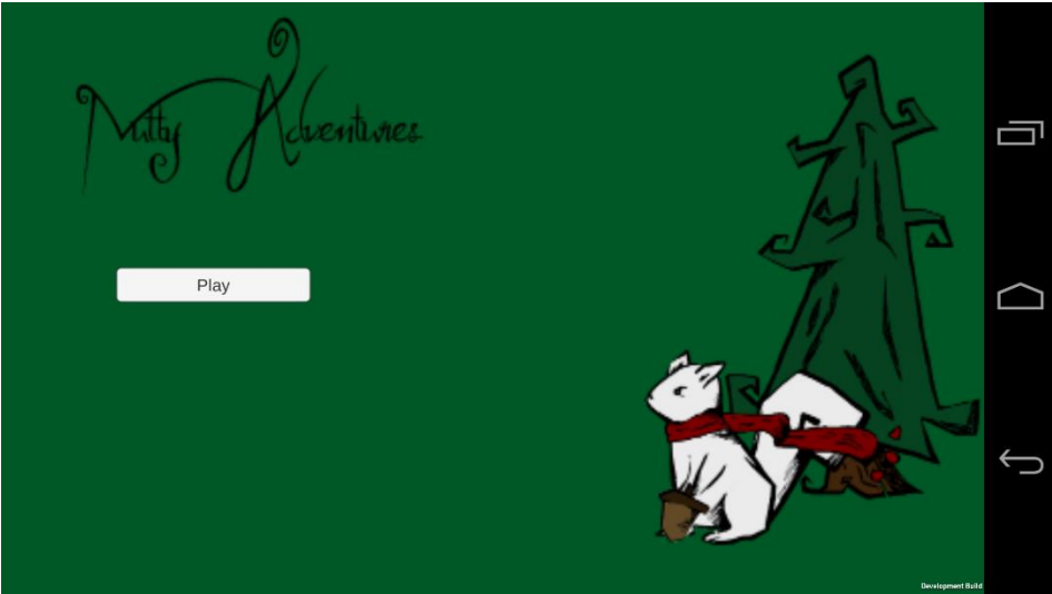
Figure 1 Menu Screen