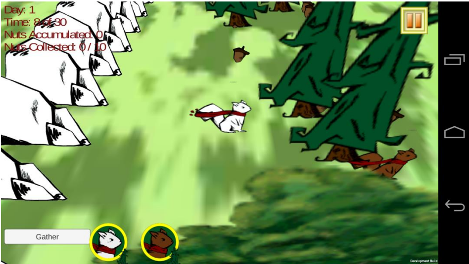
Figure 2 Start of a Game and squirrels are next to gatherable trees