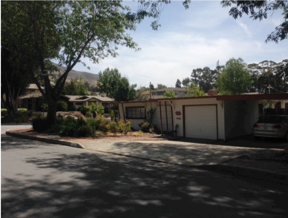
Figure 6: 2591 Greta Place.