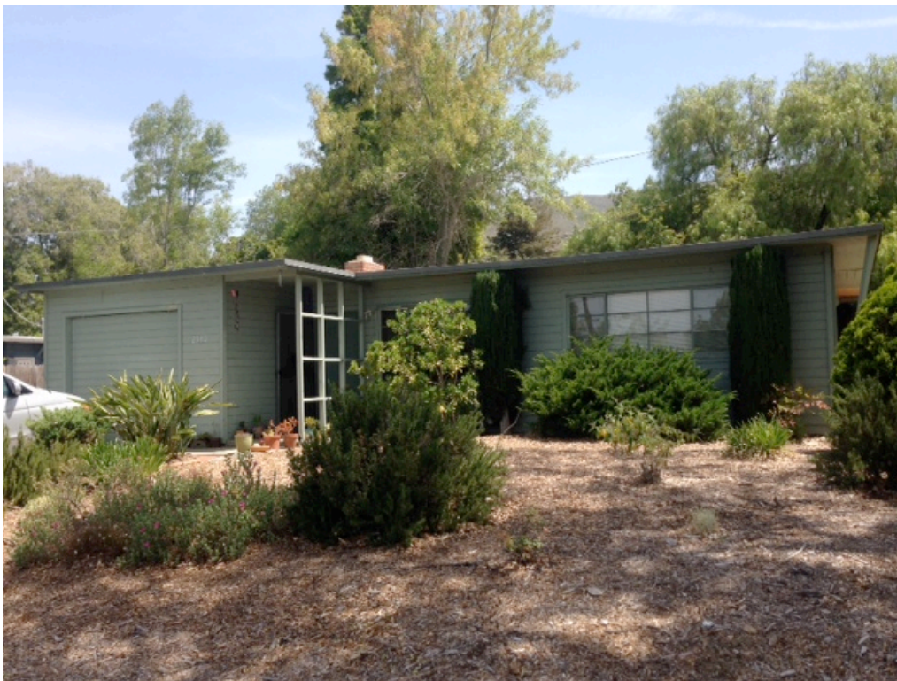
Figure 7: 2540 Greta Place.