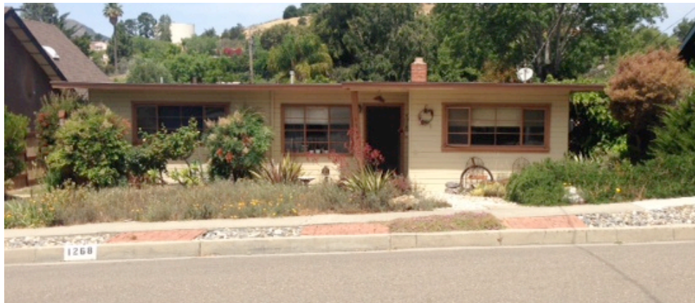
FIGURE 2: 1268 Sydney.

The Second Bay Region Tradition was a regional mid-century modern design movement that flourished in Northern California during the 1950s and 1960s. Building on the earlier First Bay Region Tradition, the Second Bay Region Tradition was aesthetically opposed to the machine-like glass-and-steel aesthetic of European and Southern California modernism. Building upon its regional antecedents by architects such as Bernard Maybeck, Julia Morgan, and A.C. Schweinfurth, architects working in the Second Bay Region Tradition fully embraced the natural elements of Northern California’s landscape and climate to