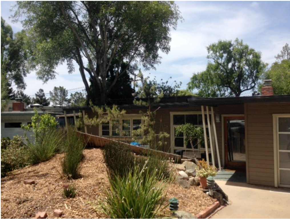
Figure 4: 2557 Greta Place.