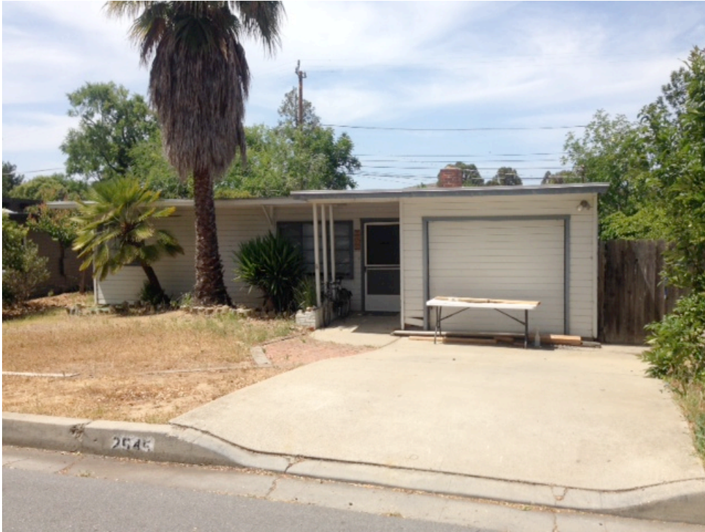
Figure 8: 2545 Greta Place.