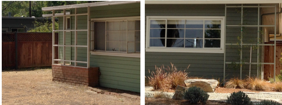
FIGURE 3: Integrated Planters.

The Greta area embodies this mentality often using materials like brick and glass in juxtaposition with wood and concrete. The long linear aspects draw on the Southern California modernism while the attention to large window placement for ventilation made it possible to take advantage of San Luis Obispo's temperate climate. Interesting, ornamental diagonal wood posts at entries and planter beds on the front facades of each structure provide a loose expression of the California midcentury pop culture phenomenon known as "Googie." 2 This hybrid of the style provides a blending of it with the Regional Tradition.