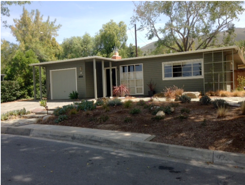
Figure 5: 2554 Greta Place.