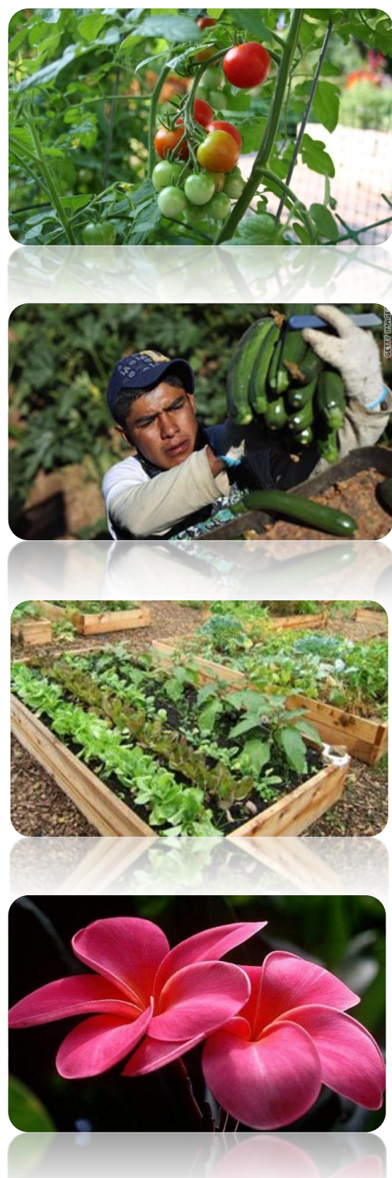
Community Gardens in Santa Maria

In order to start building a healthy community, the City of Santa Maria will need to include goals, policies and actions in the 2011 General Plan Update that will address community health through local food production. Staff recommends that the Planning Commission approve to amend the City of Santa Maria's Zoning Code to include the use of community gardens which will help implement these goals. The staff report will identify precisely how community gardens will be incorporated into the Zoning Code, including the zoning districts in which they will be permitted and conditionally permitted, development standards and rules of operation for community gardens.