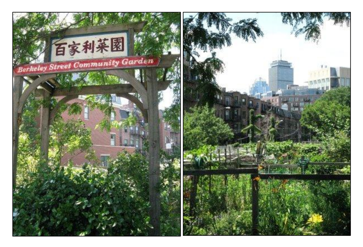
Berkeley Street Community Garden in Boston Massachusetts

Section 33-8- Community Garden Open Space Subdistricts. Community garden open space (OS-G) subdistricts shall consist of land appropriate for and limited to the cultivation of herbs, fruits, flowers, or vegetables, including the cultivation and tillage of soil and the production, cultivation, growing, and harvesting of any agricultural, floricultural, or horticultural commodity; such land may include Vacant Public Land.