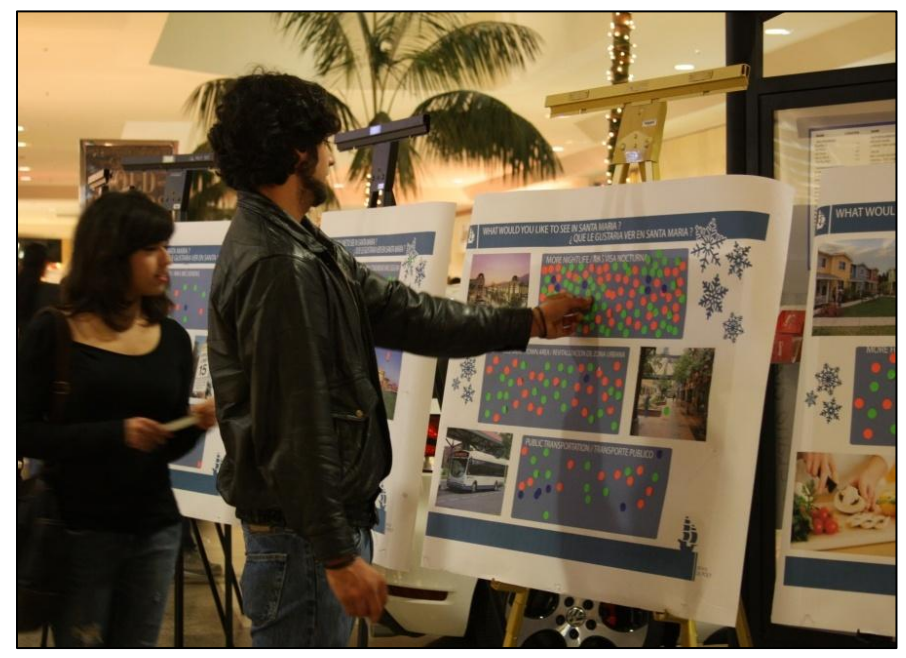
Participants placed stickers on posters representing what improvements they wanted to see in Santa Maria

At the Abel Maldonado Community Center, 12 students participated in a community planning workshop. Overall, the students were supportive of participating in community garden programs. Among the students, 54% wanted to actively participate in a community garden, 31% didn't want to participate, and 15% thought they might participate. The community input received at the grocery stores showed an even stronger support with 93% of voters supporting urban agriculture/community gardens.