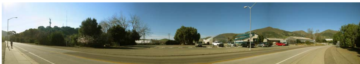
Figure 5: Panoramic view of the project site and parking lot from Highland Drive

The design and placement of this project is very important because it will be the first building seen while entering the campus on Highland Drive. The Cal Poly Master Plan eventually envisions campus with only two entrances, one on Grand Avenue and one on Highland. This exaggerates the importance of this building because it may be the first impression of Cal Poly to a visitor. The following image is a panoramic view from across Highland Avenue. The photograph highlights the visibility of the project site from one of the campus's main entrances.