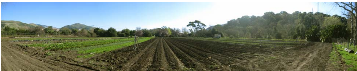
Figure 4: Panoramic view of the Homegarden

2.4 This field accounts for about 2.5 acres of the organic farm. Located along Highland, it is the closest field to campus and the Crops Unit. It is on the edge of this field that the proposed Organic Farm Market would be built. This field has been recently certified organic and put into more intensive use. There are currently plans to route potable water to this field, which will provide sufficient water for the market.