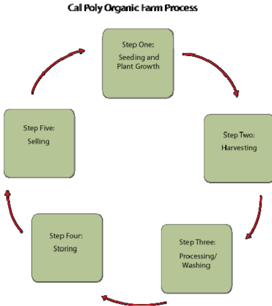
Figure 2: Cal Poly Organic Farm process diagram

There are five major stages in the production and sale of the Cal Poly organic vegetables: seeding and plant growth, harvesting, processing and washing, storing, and selling.