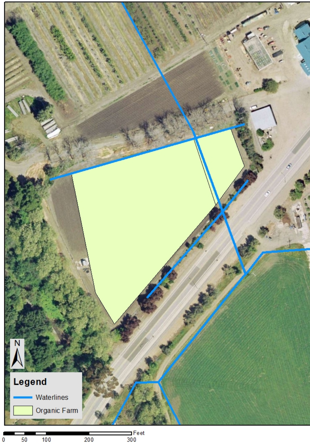
Figure 6: Cal Poly Organic Produce Center site map with waterlines