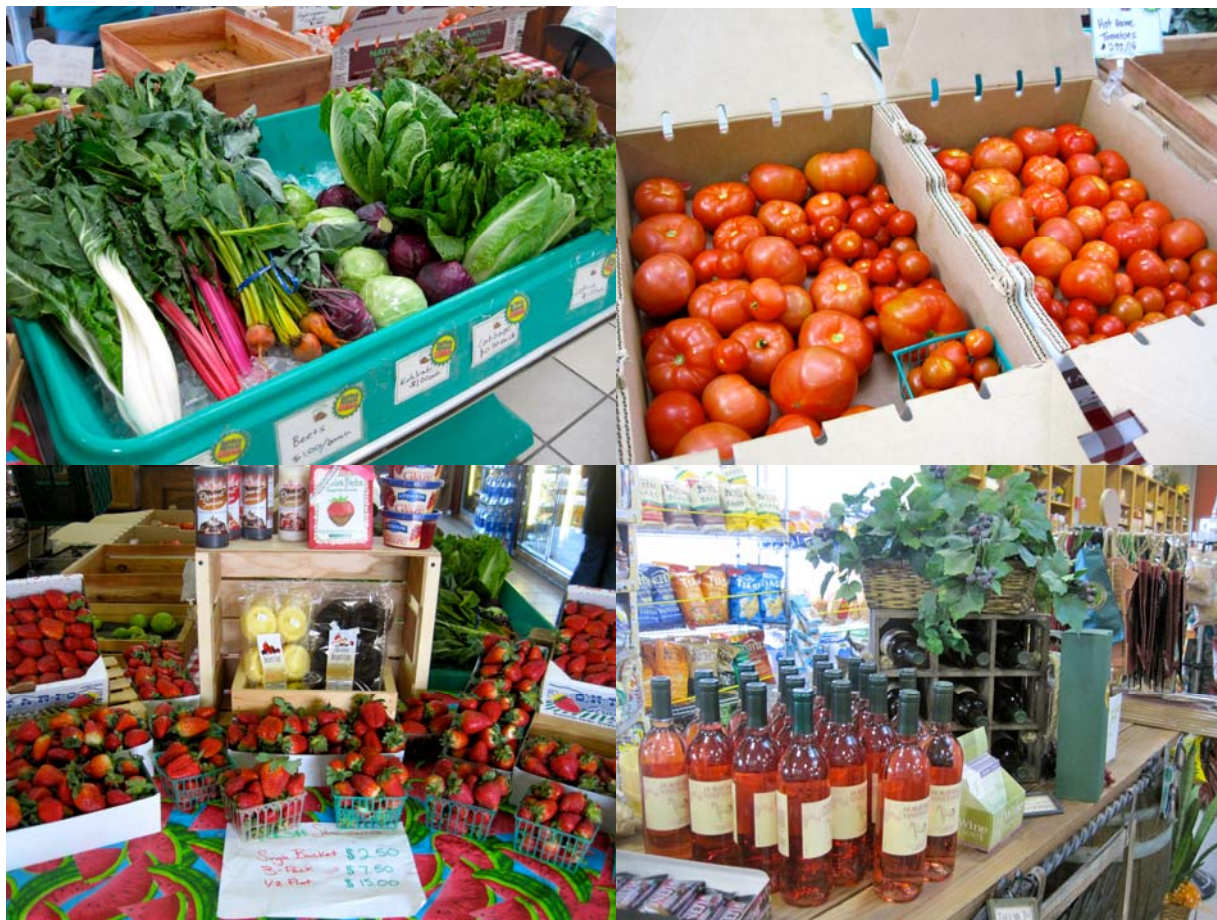
Figure 7: The Farm Store at Kellogg Ranch, Cal Poly Pomona – produce collage