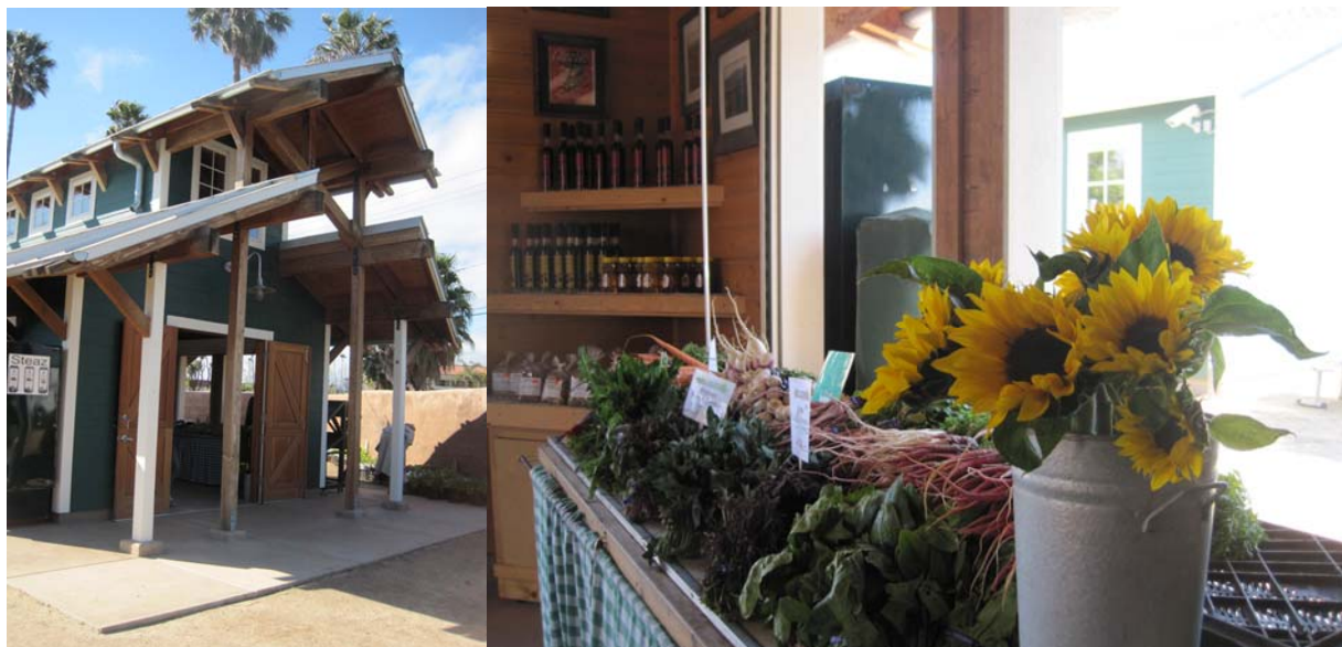
Figure 8: McGrath Family Farms – Farm Center indoor and outdoor

The Farm Center is a great architectural example of what the Organic Farm Market could look like. Mario Colletti, a long-time McGrath Family Farm employee, explained that the Farm Center was modeled after a horse barn (personal communication 2011). The high ceilings and large open walls allow for natural ventilation to keep the center cool and fresh. There is one small cooler at the exterior of the building for some overnight storage, but the farm sells only freshly picked produce.