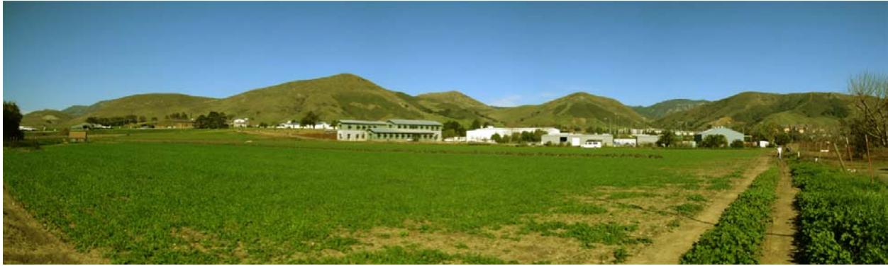
Figure 3: Panoramic view of Field 34