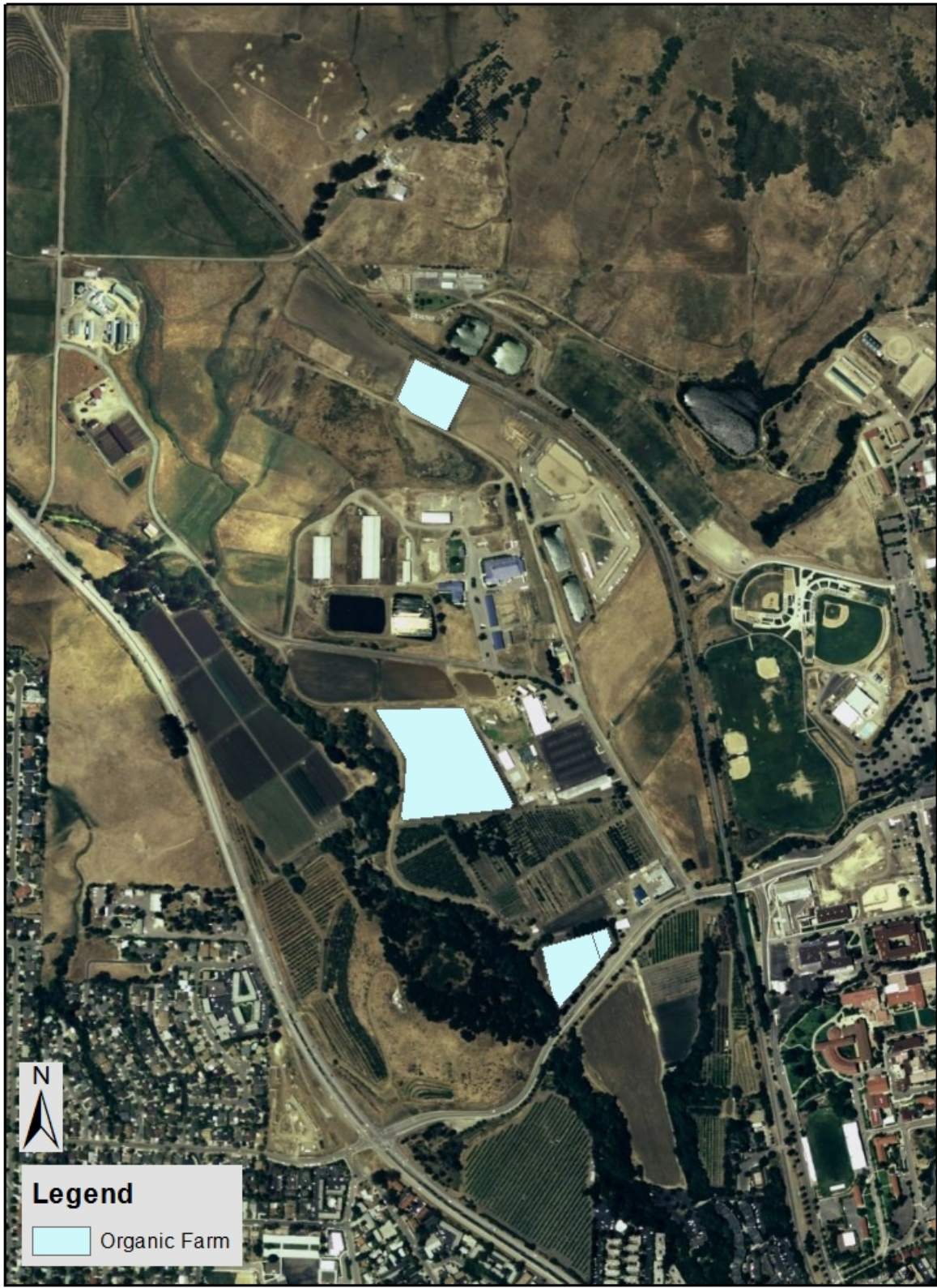
Figure 1: Cal Poly Organic Farm site map