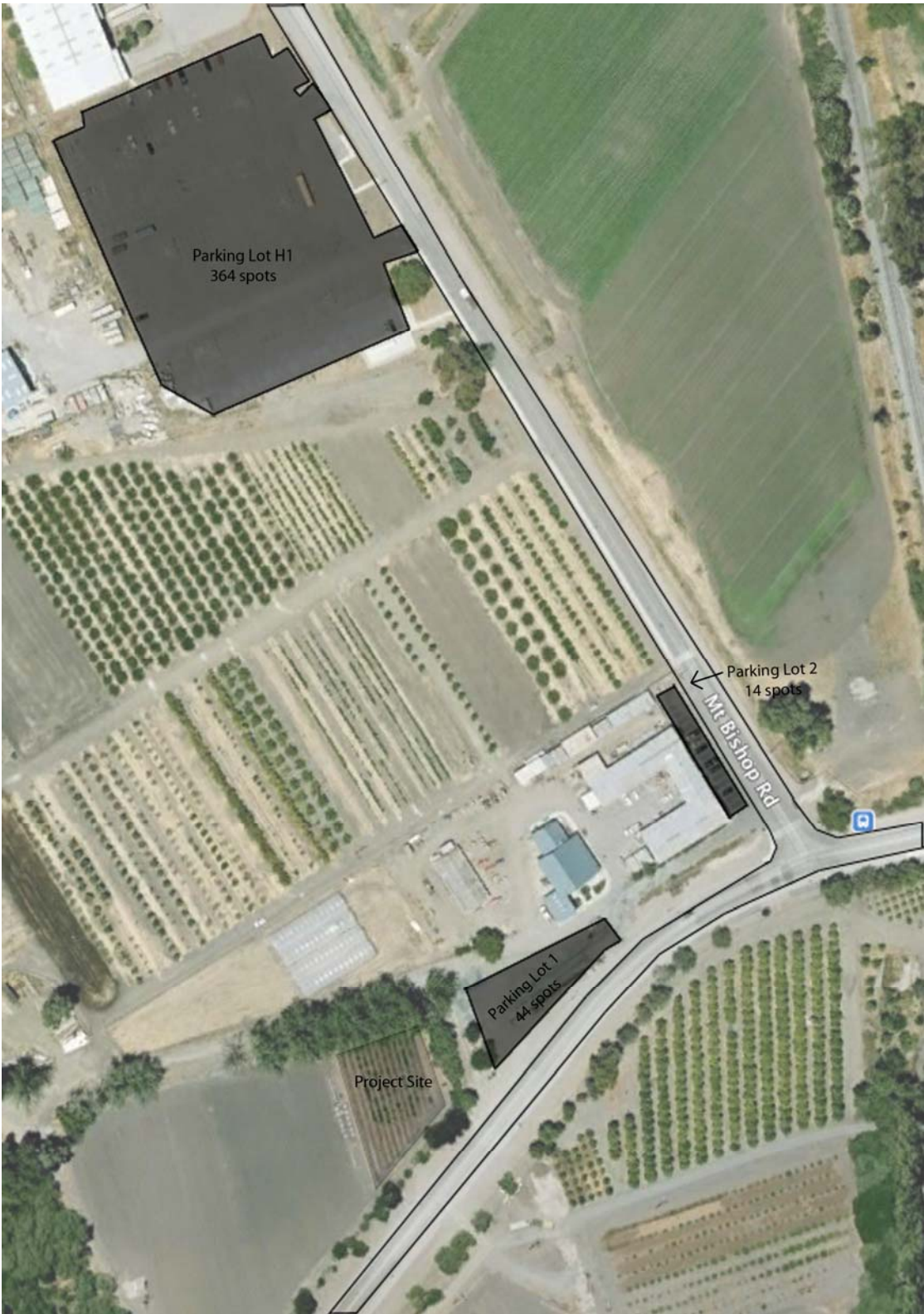
Figure 11: Highland Drive and Mount Bishop Road – Potential Parking for Organic Produce Center