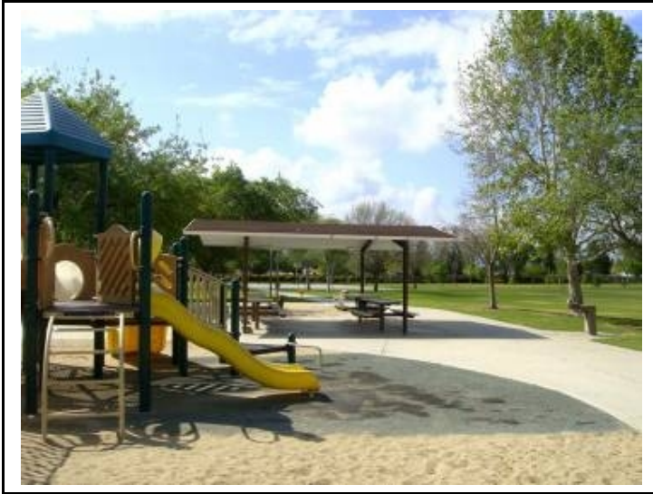
Figure 6. A safe playground, open space, and basketball court promotes an active lifestyle and provides a variety of outdoor activities.