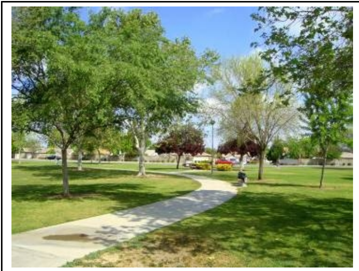
Figure 7. The park is conveniently located within a neighborhood but is accessible to the public.