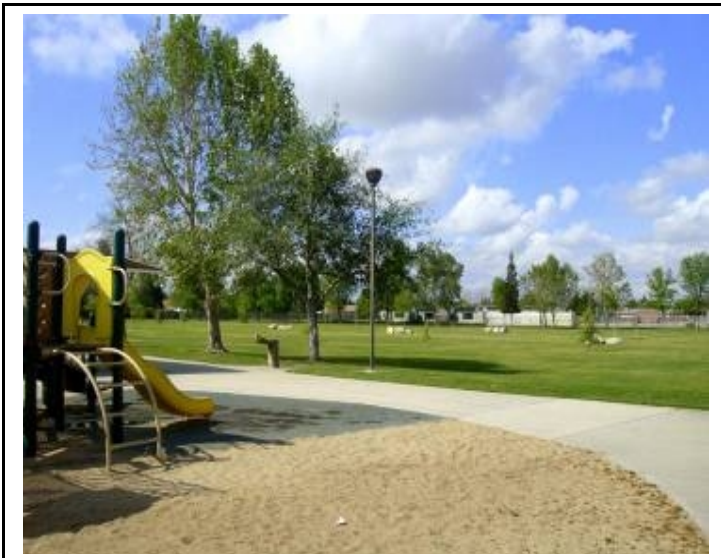
Figure 8. This park is a multi-use park centrally located adjacent to an elementary school and is within a neighborhood. The park area may be used by the students, but still open for public use on the weekends.