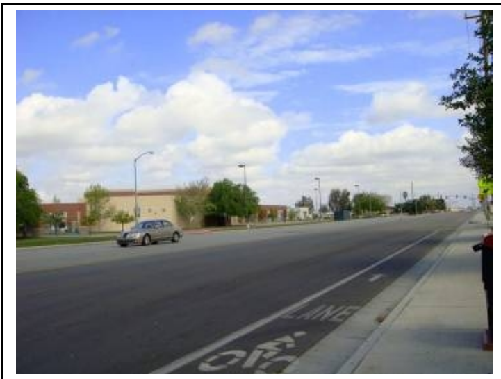
Figure 5. There are different accessible options for students to attend school—biking, walking, using the school bus, or using public transportation.