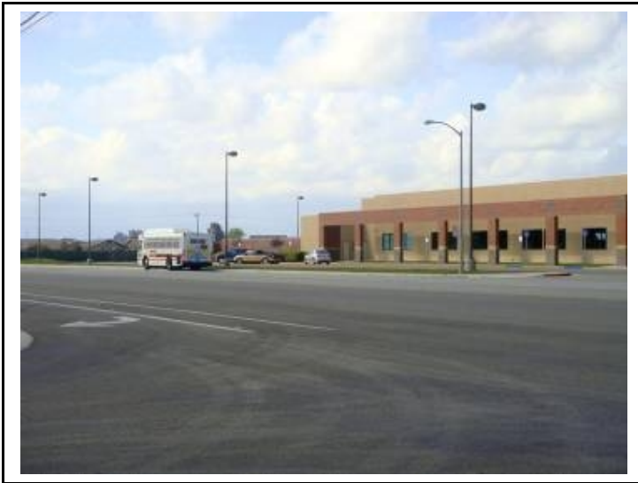
Figure 4. The location of the high school is a great example of healthy city planning. The high school is located within a neighborhood and a transit stop is located in front of the high school.