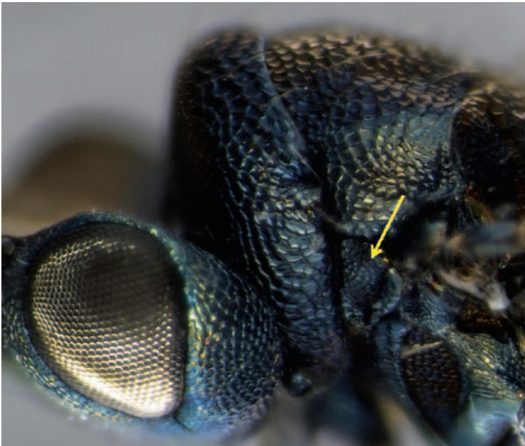
Figure 1. Lateral view of Paracrias pluteus adult female. Lateral view of Paracrias pluteus Hansson, 2002 (Hymenoptera: Eulophidae) adult female with detail to prepectus entirely reticulated and its less bright body color. Teixeiras, Minas Gerais State, Brazil.

Paracrias pluteus belongs to the ordinatus species-group, which is characterized by the forewing which has a narrow membrane along the fore margin of marginal vein, post-marginal vein absent, a very large speculum, and wing membrane distal to speculum sparsely setose (Hansson 2002). Within this group, P. pluteus is distinguished mainly by having a strong, transverse and flat carina on procoxae and with prepectus fully reticulated (Figs 1 and 2). Males are distinguished from females by having all flagellomeres distinctly separated, a longer petiole and by being more colorful (Figs 1 and 2).