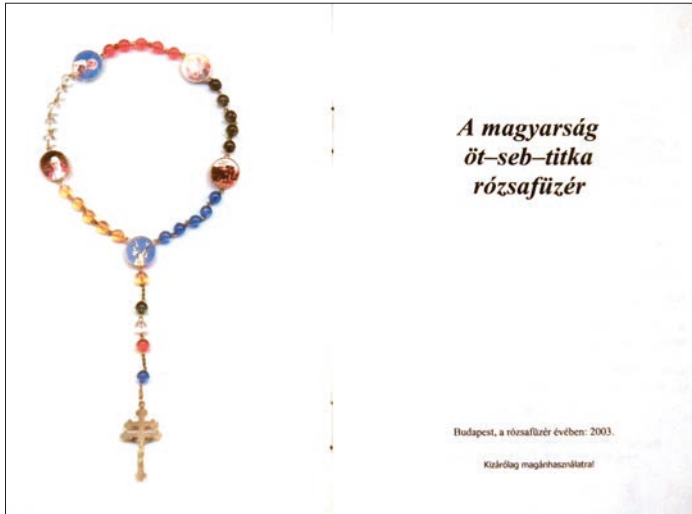
Cover of the prayer booklet presenting the Mystery of the Five Wounds of the Hungarian People rosary.

The Latin prayers were introduced with the help of a teacher of Latin and Romanian who sometimes takes part in the devotions; it was considered important to introduce them because they regard the Latin language as the purest, in the sense that it is the most free from sacrilegious words. The special feature of this form of prayer is that they not only pray in several languages (both alternately and simultaneously 84 ), but also that they learn a given prayer in an unknown language. The difficulty they undertake adds to the value of the sacrifice.