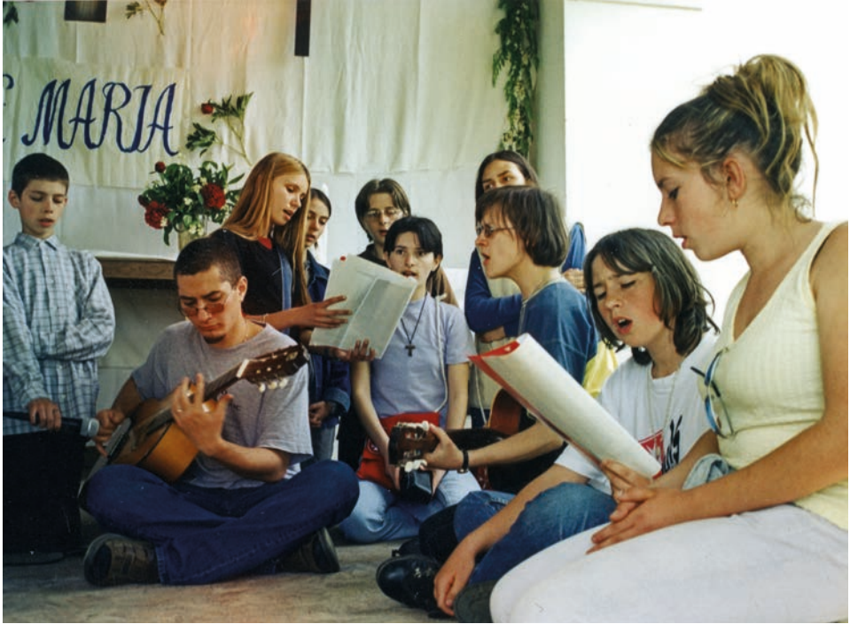
Prayer hour for a children's group on the May youth atonement day. Szőkefalva/Seuca, 2002.