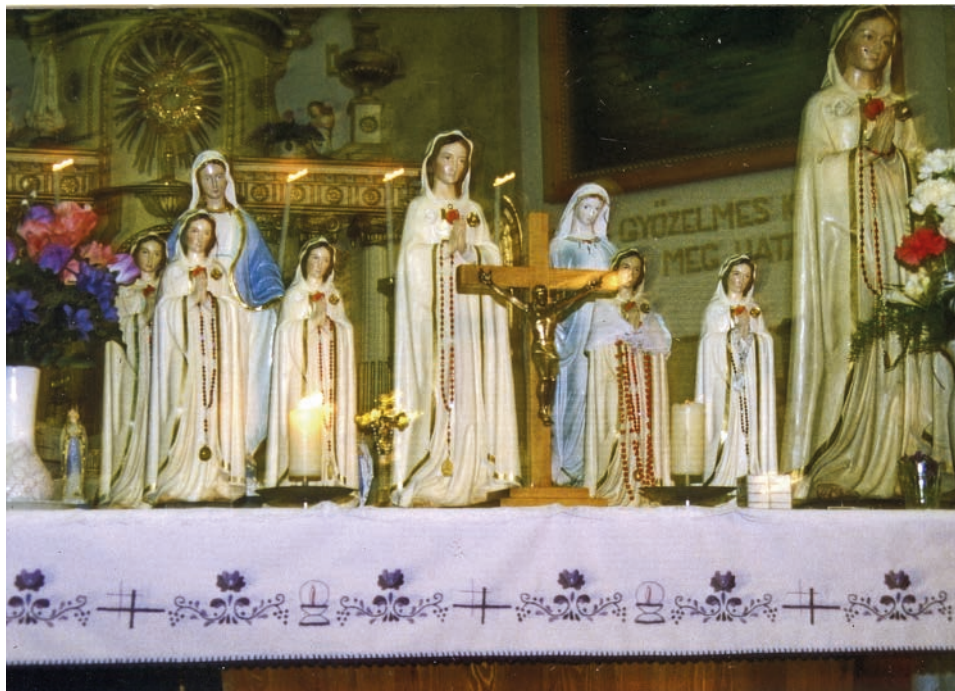
Atonement held on the 12 th of each month in the Saint Michael Archangel parish church in Érd-Óváros, the altar with statues of Mary carried by the pilgrims. Érd, 1995.

86 times since 21 March 1999 65 , Szilágynagyfalu 51 times since 13 August 2004 66 , Medjugorje 14 times since 20 October 2007 67 , Lourdes three times between 2005-2011 and Fatima on two occasions, in 2005 and 2011.