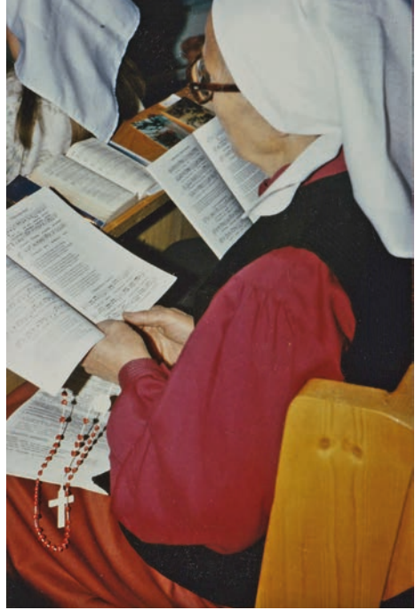
Devotions in a Charbel prayer house, showing the Atonement Prayer Hour prayer booklet and the Flame of Love rosary in use. All the participants are wearing the prescribed white headscarf. Csíkszentdomokos/Sândominic, 1994.

According to his idea, with the Trianon peace treaty (1920) resulting in the loss of five parts of the country, Hungary received five wounds, that is, it was crucified, thereby reaching the highest degree of atonement sacrifice. Five Hungarian vocations 81 are expressed in the mysteries of the rosary, each fifth bead is followed by a medal bearing the portrait of a historical figure, a person of the church or a saint. 82