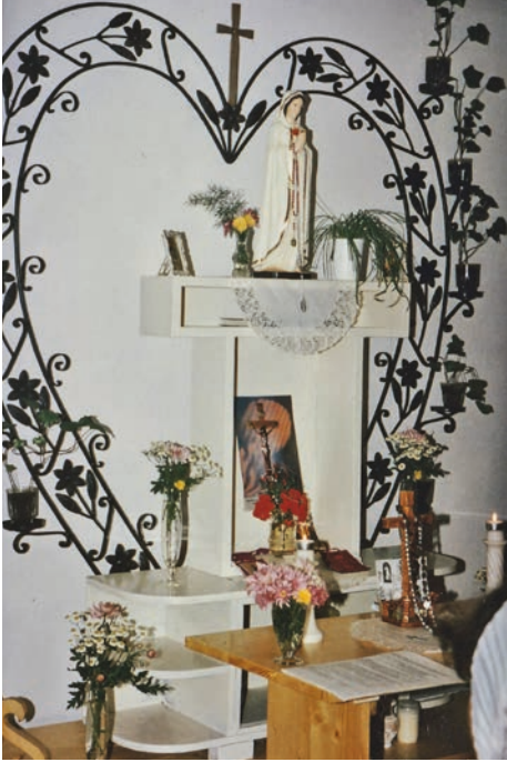
The "altar" in a privately owned Charbel prayer house. Csíkszentdomokos/Sândominic, 1994.