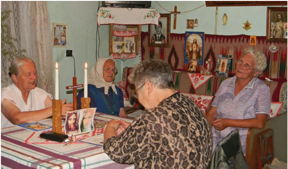
Atonement devotions performed regularly every week in a private house under the influence of the phenomena in Szilágynagyfalu/Nuşfalău. Csíkmenaság/Armăşeni, 2011.