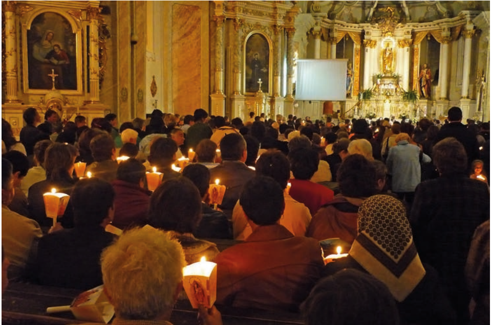
“Greeting Mary” on the first Saturday in the Csíksomlyó/Şumuleu Ciuc votive church. Csíksomlyó/ Şumuleu Ciuc, 2010.

clusion on 17 June 2005 when Mary made a declaration as the Queen of Light. On the occasion of her second and third appearances Mary initiated the creation of prayer groups, and the establishment of a “prayer centre”. To meet the requests in practice an atonement community was formed of two different denominations (Roman Catholic, Orthodox), and ethnic groups (Romanian, Hungarian), and night-time atonements on the 17 th of each month were introduced from December 1999. In my opinion the ideas for the practical implementation were influenced not only by the local parish priest and his faithful 69 but also by pilgrims from the Székelyföld region who were in close contact with the seer from the time of the second apparition. A number of them were committed practitioners and disseminators of atonement and they also had experience in launching the devotion practice. In response to a request received in a later message, the devotions on May 17 th were proclaimed the day of youth atonement.