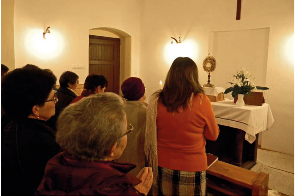
Atonement held together with the Act of Adoration on the 13 th of each month in the side chapel of the Zetelaka/Zetea parish church. Zetelaka/Zetea, 2010.