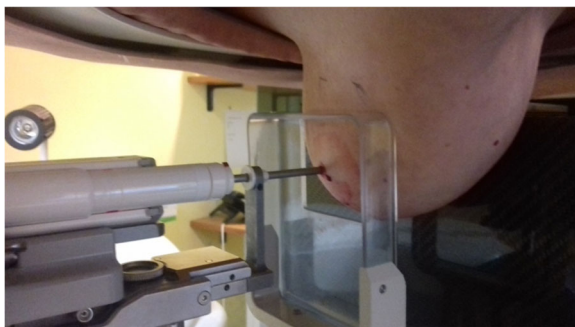
Fig. 2 Mammography-guided (stereotactic) vacuum-assisted biopsy. The patient is in prone position lying on the table over the field of view of the image, with the breast pendent by gravity (she does not see the procedure). After local anaesthesia, the needle is guided to the lesion by the computer on the basis of specifically acquired mammographic images

In the last few years, mammography guidance can also be performed using digital tomosynthesis, a technique