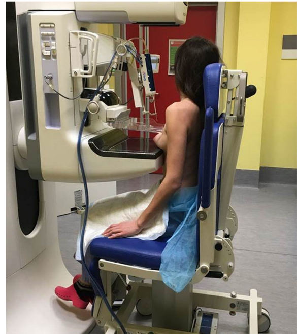
Fig. 3 Mammography-guided (stereotactic) vacuum-assisted biopsy. The patient is sitting on a dedicated chair. After local anaesthesia, the needle is guided to the lesion by the computer on the basis of specifically acquired mammographic images

that provides images of thin slices of the breast [8, 62, 63]. These systems allow for precise localisation of the target with reduced time and radiation exposure compared to conventional stereotactic biopsy under mammographic guidance [64, 65]. The duration of a tomosynthesis-guided biopsy is about 10–15 min.