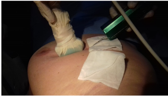
Fig. 1 Ultrasound-guided core needle biopsy. The patient is in supine position. After local anaesthesia, the ultrasound probe (on the left) guides the needle to the lesion

information to the operator [60, 61]. Stereotactic interventions are performed using dedicated prone tables, where the biopsy equipment is located below the patient, thus not visible to the patient during the procedure (Fig. 2), or upright mammographic add-on systems, with the patient usually sitting (Fig. 3) or lying in lateral decubitus during the procedure. A mild compression is required for breast immobilisation.