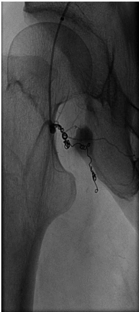
Figure 2. An angiogram of post-embolisation. A pseudoaneurysm was embolised with micro coils.

at risk when a release of the iliopsoas tendon is performed, although, in a more distal position, they are protected by the presence of the iliopsoas bursa and the vastus intermedius [3]. Hip arthroscopists should bear the possibility of adhesions and these complications especially when performing revision hip arthroscopy; however, it is not difficult to comprehend that such a complication could happen even during an open procedure.