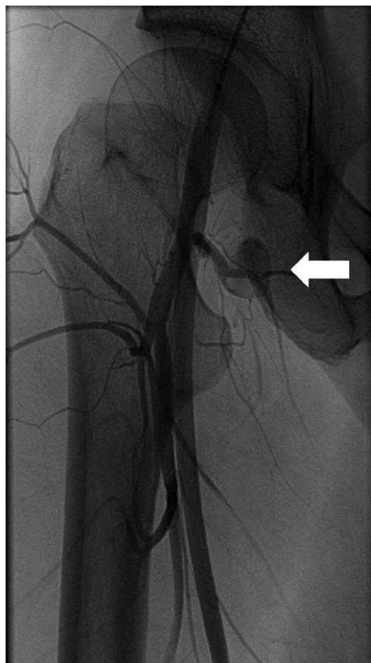
Figure 1. An angiogram of pre-embolisation. A 15 mm pseudoaneurysm which arose from a circumflex femoral branch that arose directly from the posterior aspect of the femoral circumflex artery is shown (arrow).

The femoral circumflex artery consists of two branches: medial femoral circumflex artery (MFCA) and lateral femoral circumflex artery (LFCA). The MFCA has its origin from the