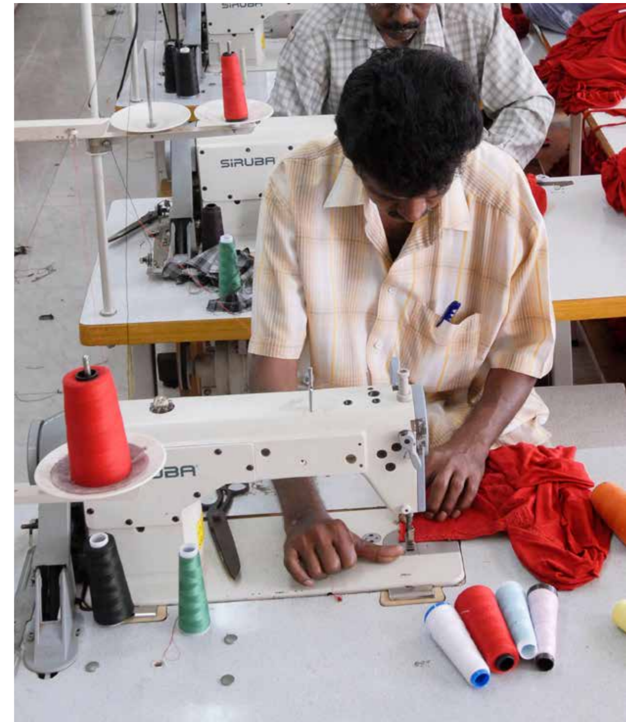
Tirupur factory workers

Finally, we found that workers were not disillusioned about their experiences. They were aware of what to expect prior to working, and on the whole reported a close match between their expectations and their experience. Worker exploitation in some form, we observe, is expected and embedded practice at all levels of the home, the workplace, and the supply chain.