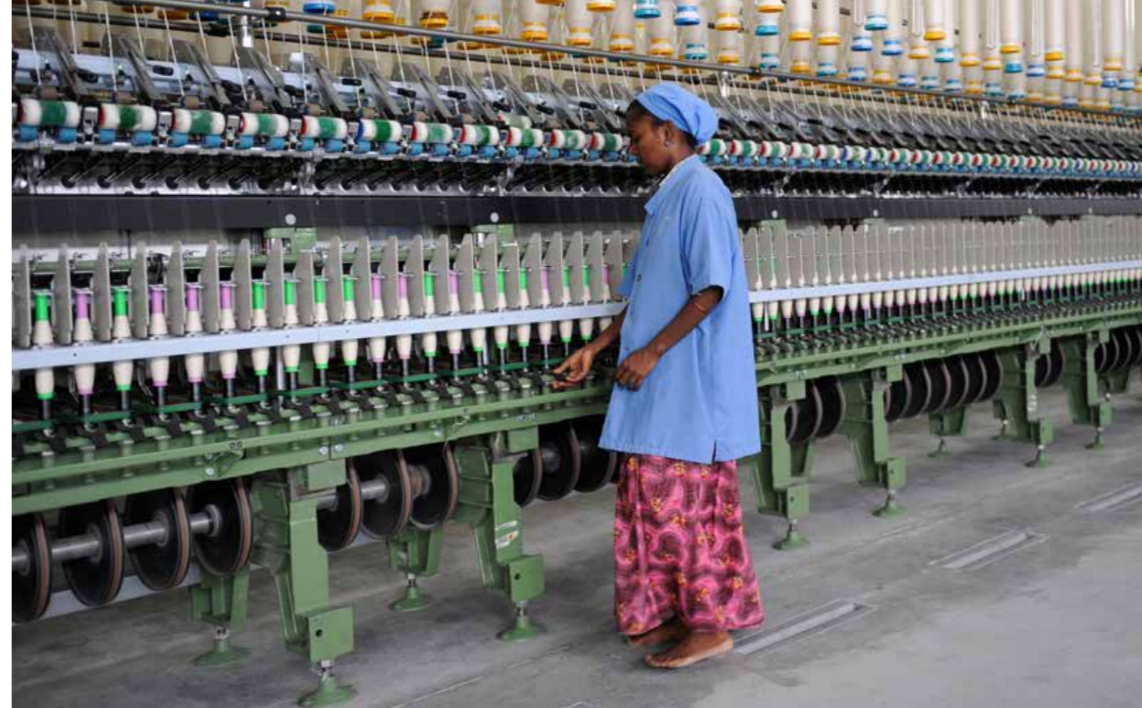
Cotton worker

Living costs in Tirupur are high, which hampers worker recruitment and retention. One solution has been a combination of company buses to transport workers to town and hostels to house them. But both of these options come with high costs and risks (see responsible migration pathway). Some companies have therefore opted to try out a more radical response, which is to move production units to rural areas where workers are more abundant and opportunities scarce. Relocating is less viable for spinning mills compared with garment factories, as they have already invested in their significant infrastructure, mostly already located in rural areas. But overall, this pathway offers a number of opportunities and challenges: