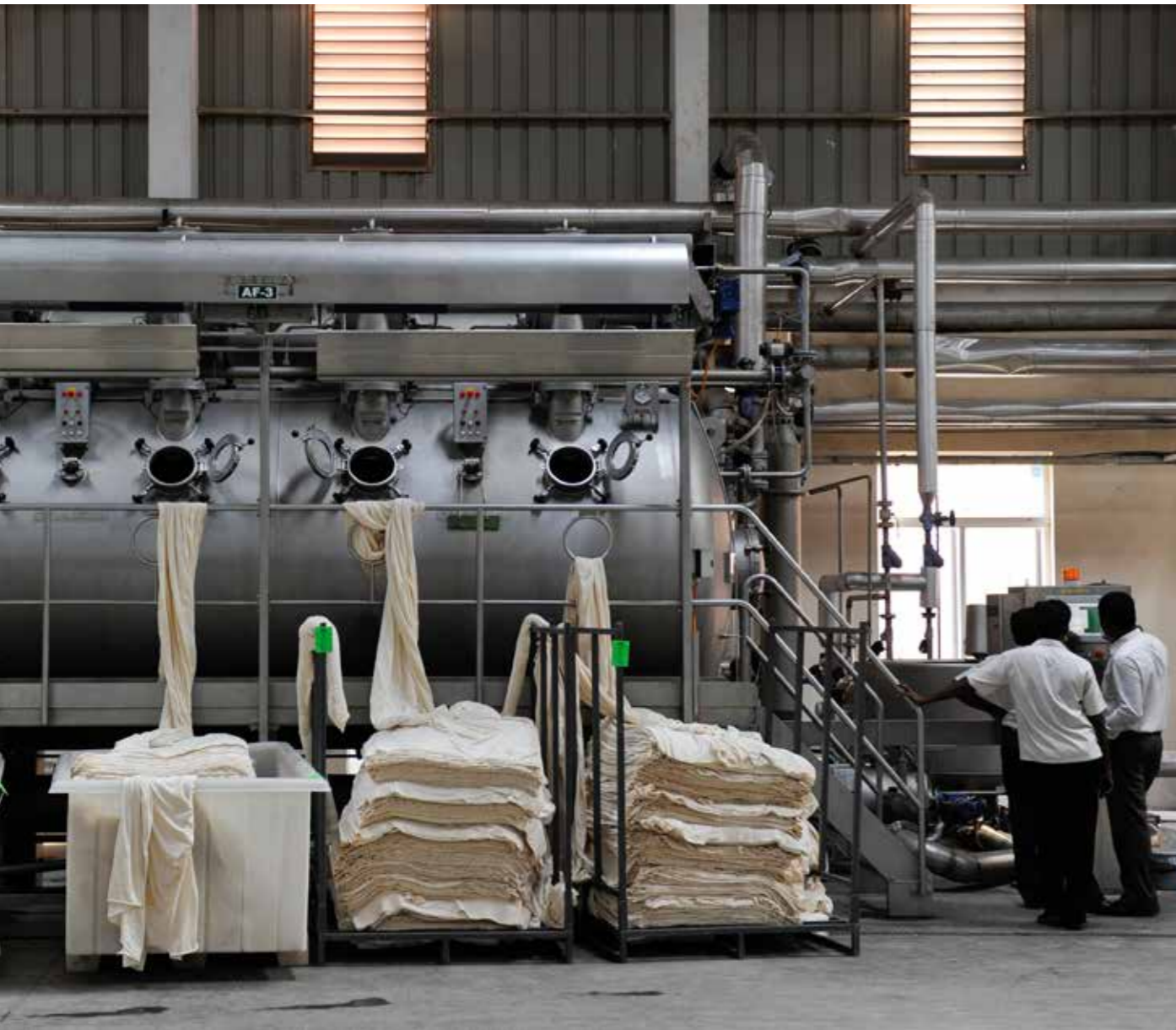
Tirupur textile factory

Indeed, the clearest finding from our research regarding responsible sourcing is the significant extent of deliberate circumvention of social audits by many firms in the cluster. Although there are clearly a number of firms that are diligent in meeting the social compliance requirements of buyers, interviews with workers and other stakeholders revealed that audit cheating is commonplace. This is manifested in a number of ways: