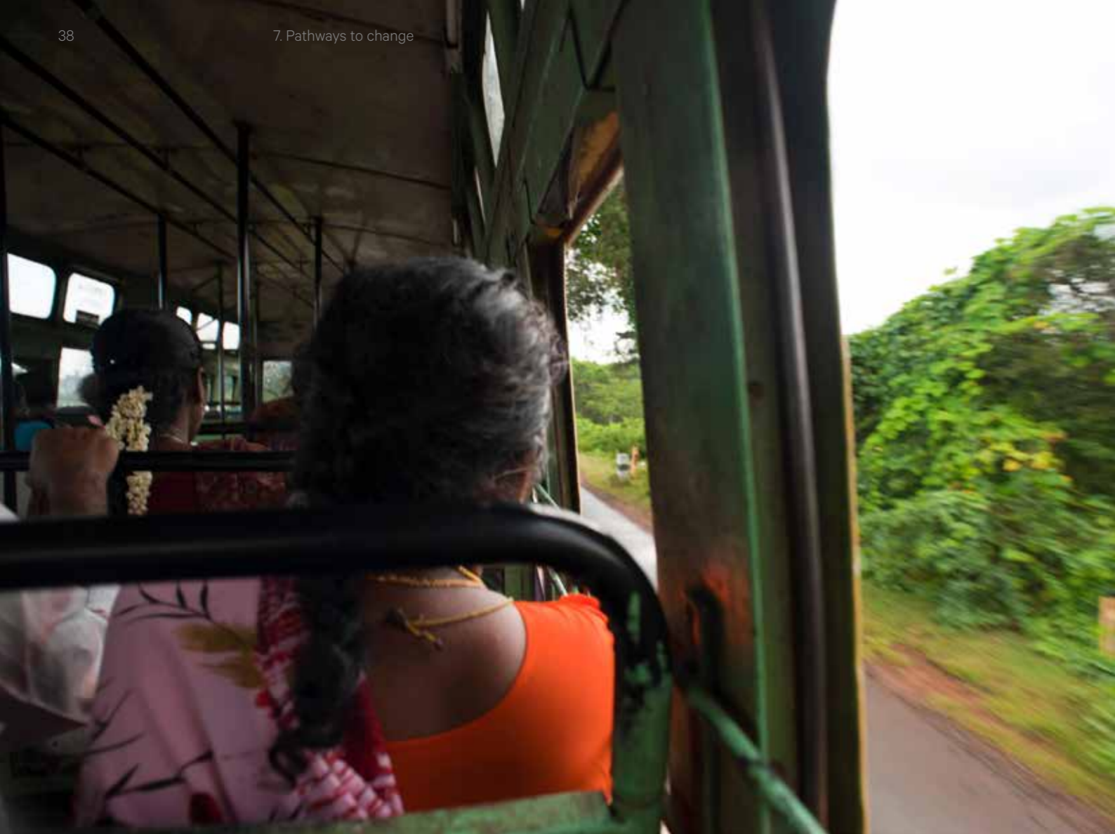
Free transportation

environmental excellence in terms of Zero Liquid Discharge and the high standard of worker pay and experience. Of course, this would entail much stricter adherence to existing laws and best practice than is present so far across the cluster. If structural factors impacting the supply and demand for worker exploitation were not addressed, then such a strategy would be extremely risky and unsustainable (see section 6. Structural Conditions above). The conditions for such a strategy to be successful are not currently present in Tirupur.