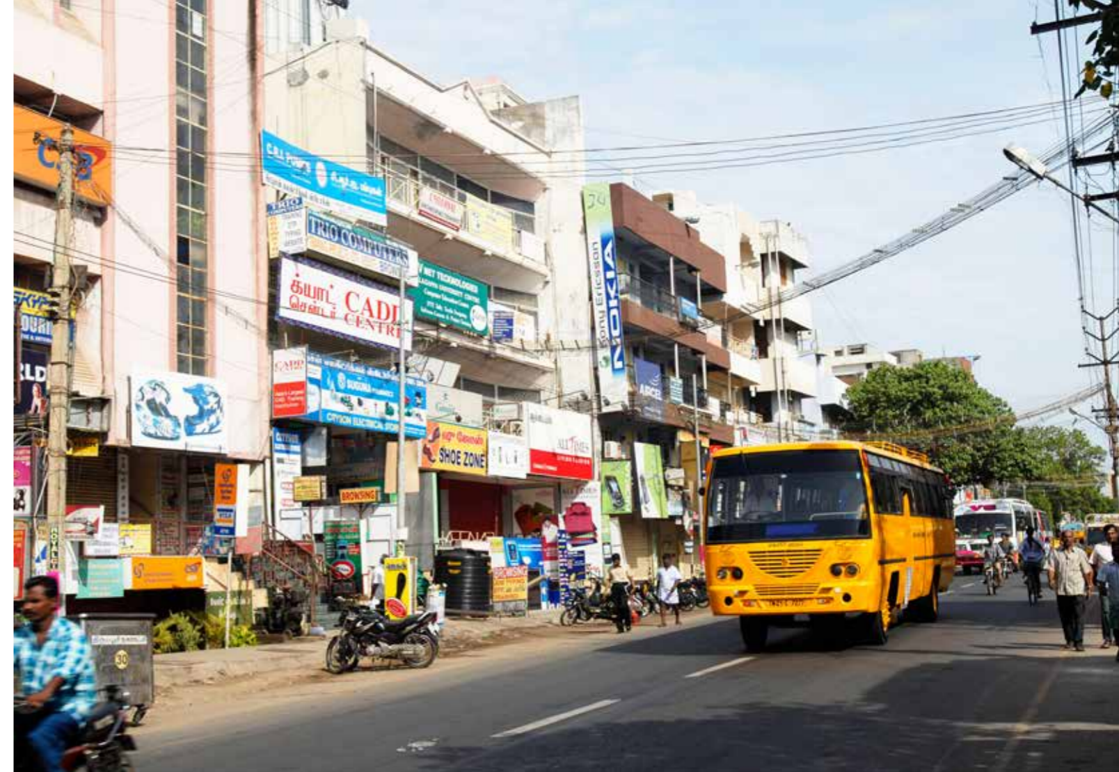
Tirupur town