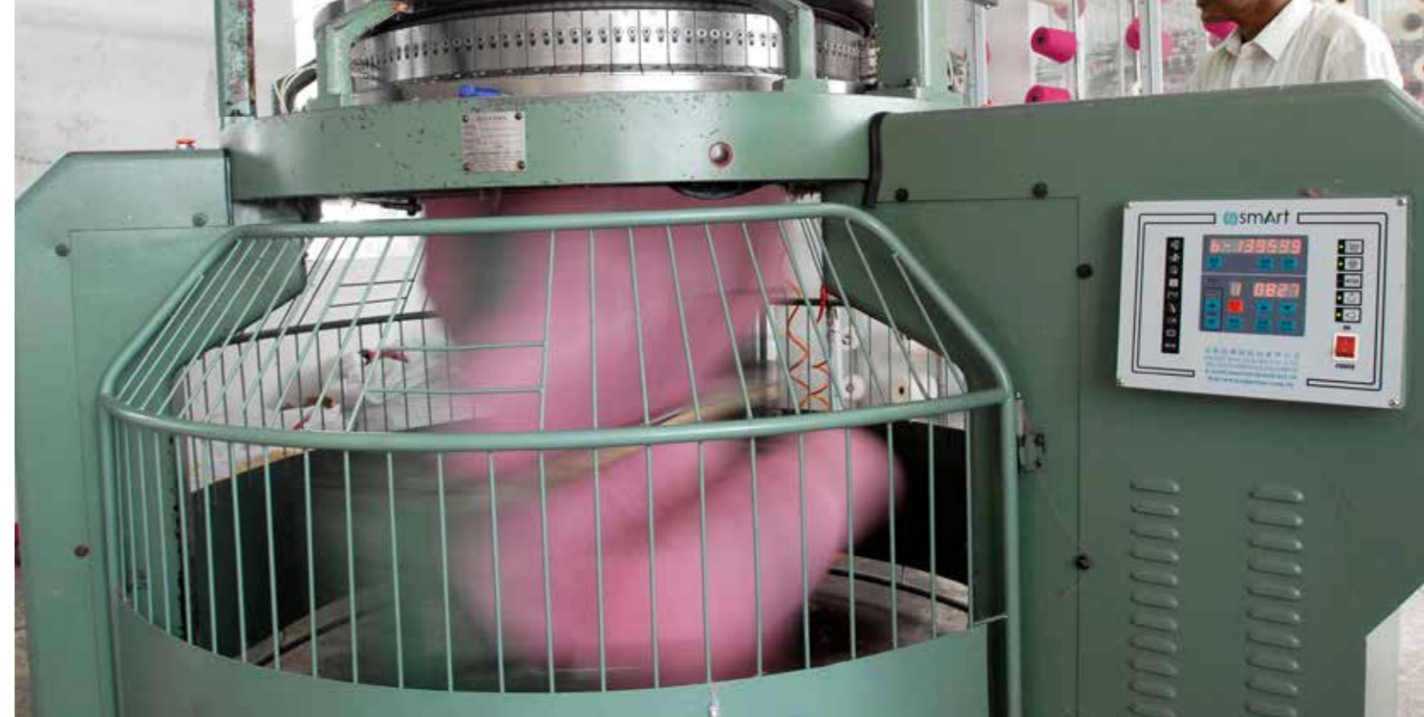
Factory equipment Tirupur

These structural conditions help to explain why labour exploitation is still common within the industry despite advances over recent years. Many businesses at the base of the supply chain are struggling to cope with business