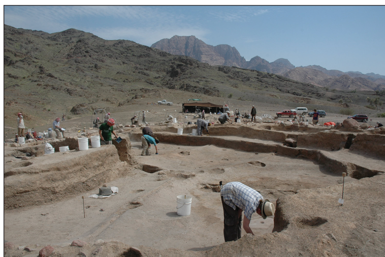
Fig. 2. Large communal structure being excavated at WF16. Note the curved benches around the edge of the structure, internal features, including inset mortars near the apex of the building.

There is no sign of a substantial increase in population, nor of demographic pressure, with sites remaining relatively rare, and most small, until the end of the Middle PPNB. What the settlement evidence does indicate is continuing change taking place in community organization. The highly diverse, specific function buildings of the PPNA are replaced in the Middle PPNB with more standard architectural forms replicated