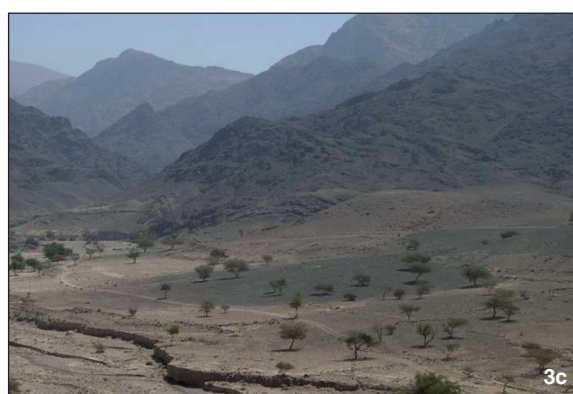
Fig. 3. Dramatic landscape positions of WF16 (3a), Dhra' (3b), and el-Hemmeh (3c). All three sites are located in the right-centre of the images. WF16 is visible as a light patch on the top of the last gravel knoll before the volcanic rock formations behind; Dhra' visible by the green sunscreen, before the vertical rock face of the edge of the rift valley; el-Hemmeh as excavation trenches open below, to the right of the striking black volcanic cone.