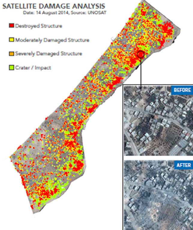
Fig. A1. Damages (Source: OCHA, 2016).