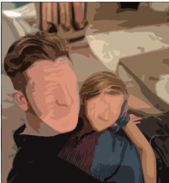
Figure 3. @dad12 on 21 October 2018 (84,413 likes, 1185 comments): To make up for [her being excluded from her sister’s playdate], we’ve binging on films together & eating our body weight in snacks - no big girls allowed. They may not care but I know it means the world to [her] as she’s smiling again which is priceless.

Emoting is the work performed by influencers in portraying their emotions to harness attention. Emotions have always been central to social media marketing because content that evokes strong emotions is shared more (e.g., Berger and Milkman 2012). Paul, a full-time London influencer, confirms that this is common knowledge: “Someone told me when I started the Instagram account that if you can make someone, laugh, angry, or cry then they are more likely to share it.” Eliciting this range of emotions through sharenting typically means finding emotion-laden family moments and sharing those with a meta-comment on parenting. Such content can vary from more humorous posts, in which fathers are depicted playing with their children, to posts that evoke and foreground their sensitivity as fathers.