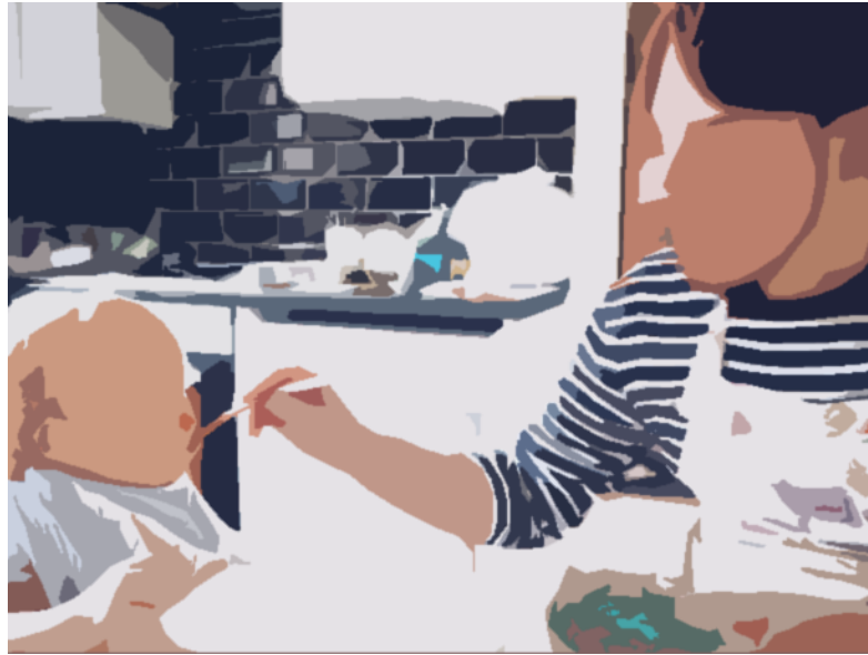
Figure 7. @dad7 on April 3, 2018 (50 comments, 100 likes): “As the main cook in our house I am trying to cook [my child’s] meals at the same time as ours but finding inspiration of what to make him low. Does anyone have an app or book they swear by when making kids dinners?”

Demonstrating “how doing household chores are an immanent part of their practices” (Molander 2018, p. 165), @dad7 posted an image of himself feeding his infant whilst wearing a cutesy Cath Kidston apron against the backdrop of a messy kitchen (Figure 7). In the caption, @dad7 fleshes out this everyday moment by articulating a pragmatic need for expedience by cooking meals that are both child and adult friendly. As a reference to the household’s domestic arrangements, the post highlights the fluidity of roles between the parents, but also their awareness and reconfiguration of the atypical division of labour (Klasson and Ulver 2015). Reacting to this post, @dad7’s partner teased him on his implication that there is another cook in the household: