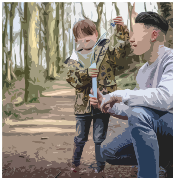
Figure 5. @dad20 on 1 May 2019 (908 likes, 35 comments): This is me, taking the kids out on my own and having endless fun 🐼. They’re always so well behaved 😊👉 can’t wait to do it again this weekend and give mommy a well deserved rest 😊 [...] #instafamsham #icallbullshit