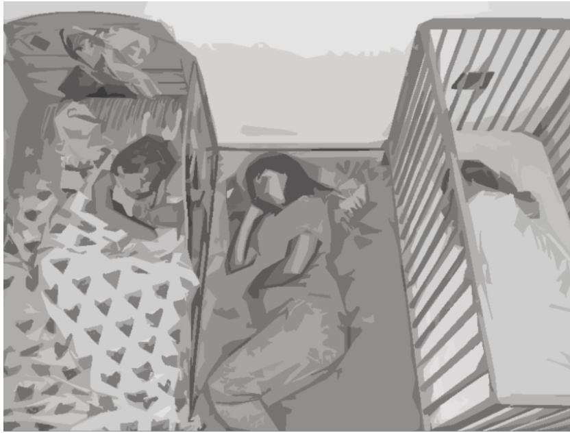
Figure 8. @dad14 on August 14, 2018 (11,530 likes and 487 comments): I was going to post something completely different tonight all on queue to try and be witty or the like. Then I realise [@spouse] was taking her time putting the kids to sleep and all was quiet on the baby monitor so down I go and these three little ones are all snoring away mama included. Fatherhood is great but motherhood is just crazy. Mamas I salute you, [@spouse] you amaze me every day keeping this family together, your kids adore you.

Posts such as these reveal a relational stance that refuses to isolate fatherhood from the co-parent (and in some instances, other caregivers), thereby diverging from the insistence on autonomy in hegemonic masculine norms (Coltrane 1996).