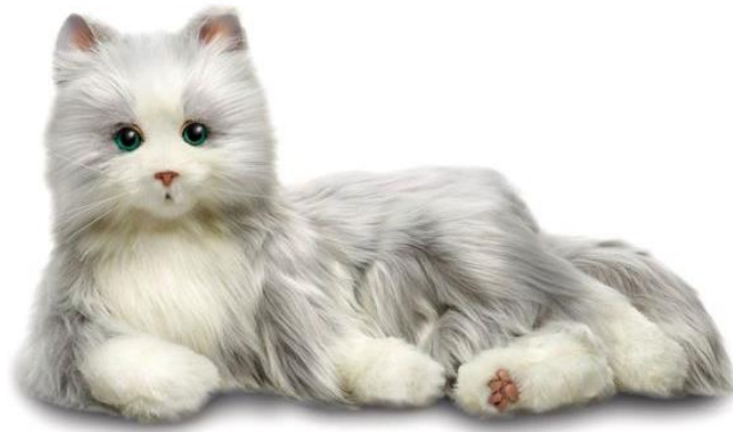
Figure 1: The 'Ageless Innovation' companion cat

This product is marketed specifically for older people, and "... with a focus on improving quality of life for aging loved ones, their families, and caregivers" ("Ageless Innovation", 2019). The cat vocalizes with meows and purrs in reaction to light and touch, via its on-board sensors. It moves its mouth, eyes, head and also rolls over, again in response to human interaction. Strictly speaking, it is not a robotic device, as in its off-the-shelf form, it is not programmable. However, it operates in two modes: mute or sound. In both modes, the cat's movements continue to function. It is battery-powered, and the researchers have tested that the replaceable battery life is long (months, not weeks).