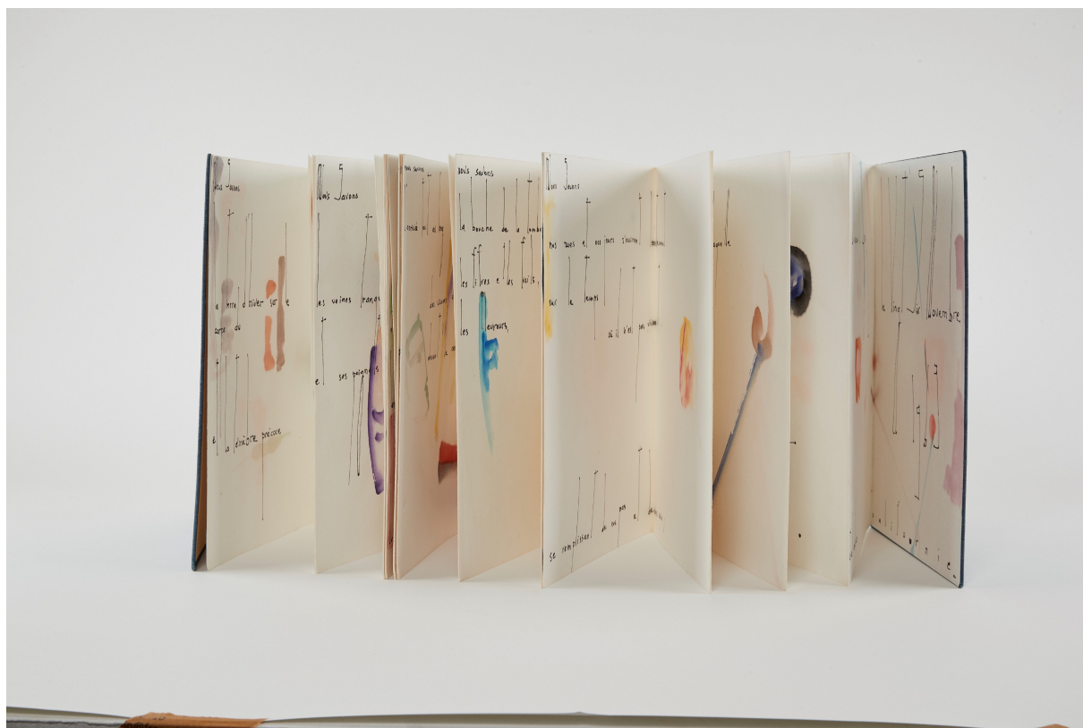
Figure 2: Etel Adnan, Wendell Berry, 26 November 1964, leporello, 1964. Exhibition at Zentrum Paul Klee, Bern, 15 June – 7 October 2018.

the ground-breaking intellectual periodical which had an immense impact on poetry writing in the Arab world. Al-Khal also opened Gallery One, a gallery which played a central role for modernist painters in Lebanon and in the Arab world as a whole and which was the first Beirut professional art gallery. Al-Khal invited Adnan to contribute to Shi'r , by translating her poems into Arabic. This was essential to Adnan, since she suffered from the fact that some people thought that she was not an Arab poet because she did not write in Arabic. She comments: "My identity was in not wanting to be rejected by Arab poets." 25 The publication of her poems in Shi'r , the most prestigious journal for Arabic poetry and modern thought, allowed her this desired recognition.