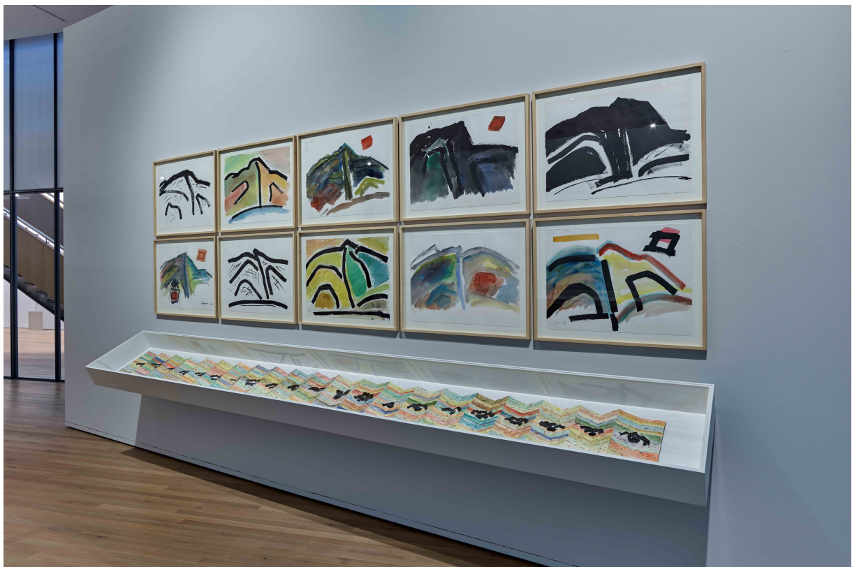
Figure 1: Etel Adnan, The Mountain, series of ten drawings, watercolor and china ink on paper, 2014 (display on wall). Etel Adnan, Journey to Mount Tamalpais, watercolor and ink on paper, 2008 (leprello in display case). Exhibition at Zentrum Paul Klee, Bern, 15 June – 7 October 2018.