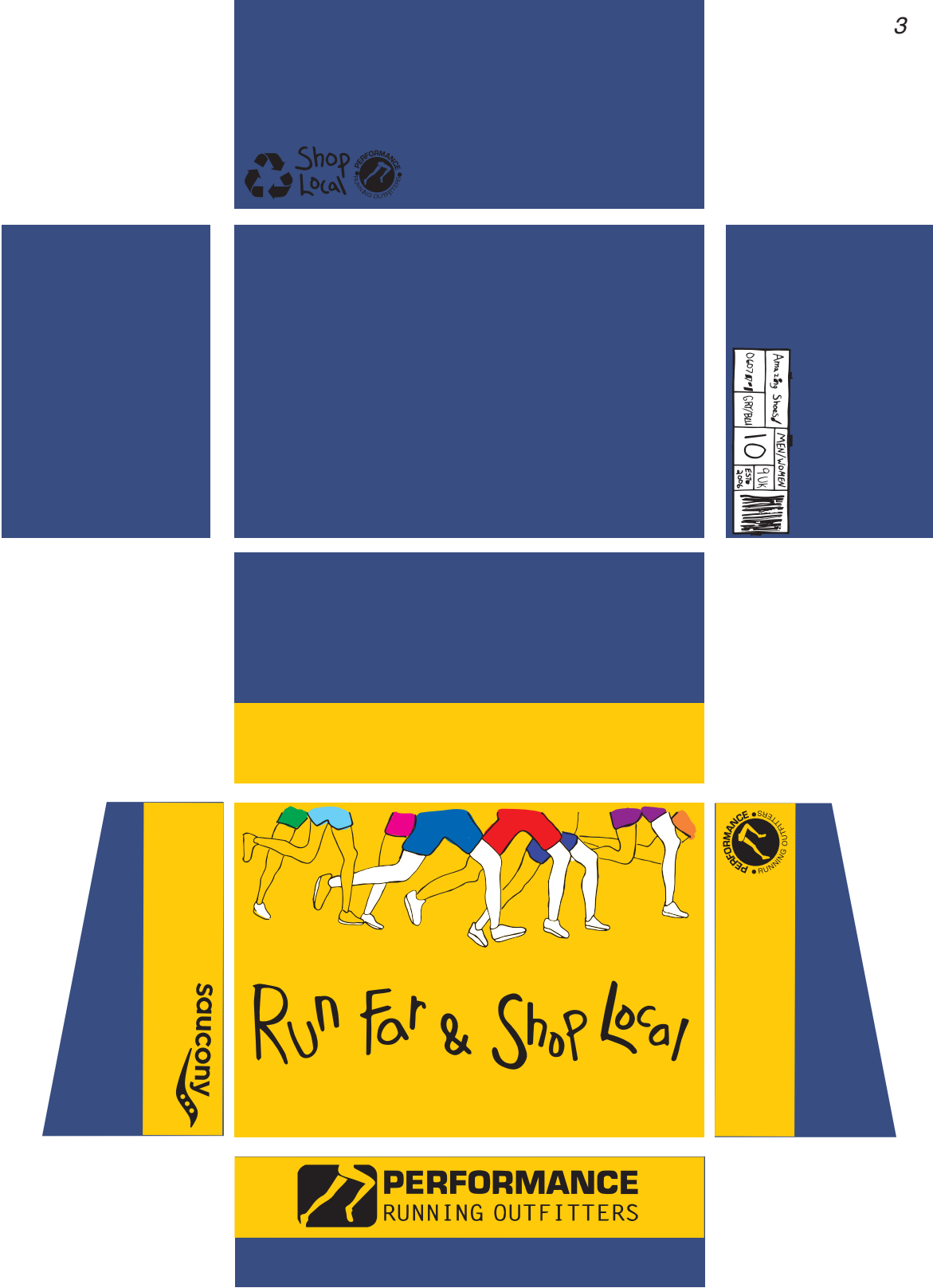
1. Main illustration used on the top of miniature shoe box 2. Illustrations used on the sides of miniature shoe box 3. Miniature shoe box design, used for small gifts and gift cards