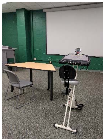
Figure 1. Traditional chair and desk compared to stationary cycle desk (FitDesk, FD Products, Kernersville, NC, USA) in the college lecture classroom.

Stationary cycle desks (FitDesks ® , FD Products, Kernersville, NC, USA) were randomly placed throughout a lecture classroom to minimize the effect of seating location on learning and attention [16,17]. The traditional desks were standard tables and chairs used in the classroom (Figure 1).