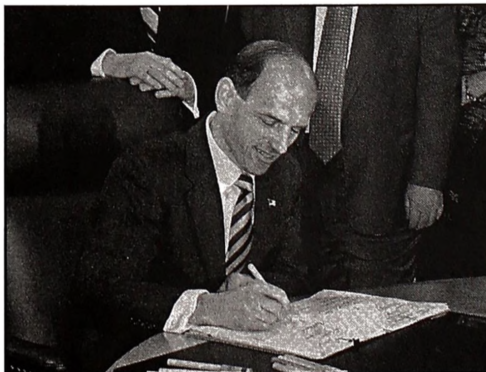
Governor Baldacci signs LD 1196 into law on March 31, 2005 declaring, “It’s the law.” Unlike the bill signed in 1997 by Governor Angus King, this law will be upheld.