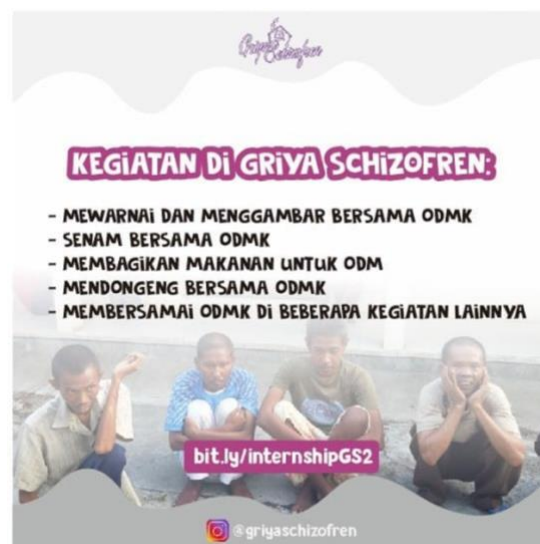
Image 4: A Flier from Griya Schizofren That Reads: “Draw with People with Mental Illness”, Instagram (Griya Schizofren, March 19, 2019), https://www.instagram.com/griyaszizofren/?hl=en .

organization is Griya Schizofren, which devotes itself to the de-stigmatization of those with schizophrenia, those most commonly subjugated to pasung . Through open invitations to the public to spend time with those suffering from the pernicious illness, this NGO seeks to attack pasung at its root cause. 23 The flyer shown below reads: “Coloring and drawing with people with mental illnesses, physical exercise with people with mental illness, sharing a meal with people with mental illnesses, storytelling with the mentally ill.” The organization hopes that through such shared activities, those with mental illness who are used to hiding away behind lock and key won’t need to be hidden. 24 Hopefully by removing the stigma of mental illness, Indonesians will begin to both seek and demand professional psycho-social support when necessary, ultimately leading to a development of the country’s meager mental health system resources.