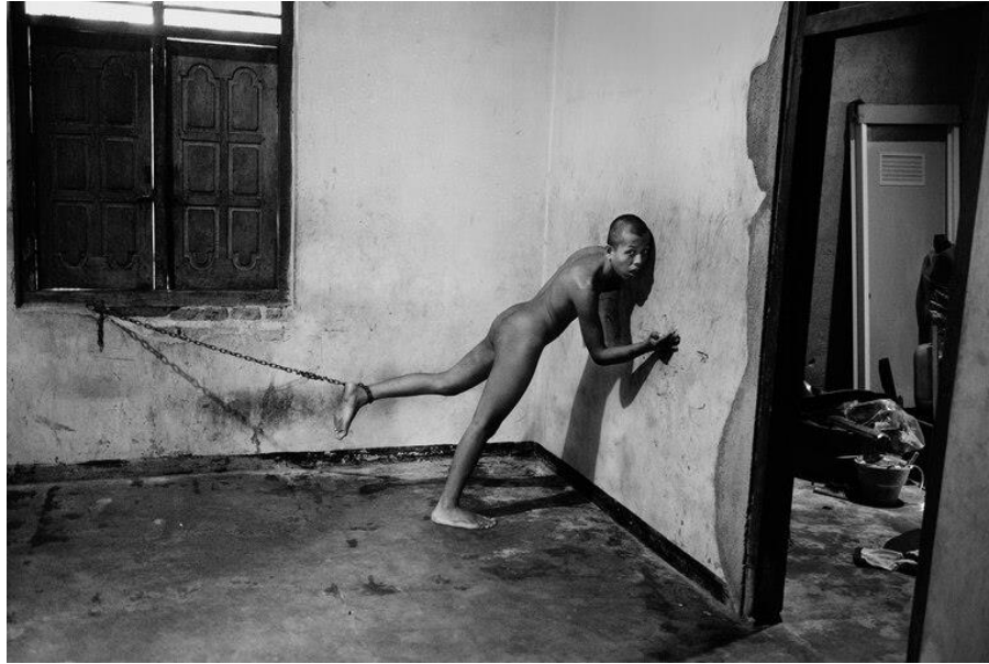
Image 1: Scott Typaldos, A Boy Chained to a Wall in One of Indonesia's "Insane Asylums" , 2016, Prospekt Photo , 2016, http://www.prospektphoto.net/hub/scott-typaldos/ .