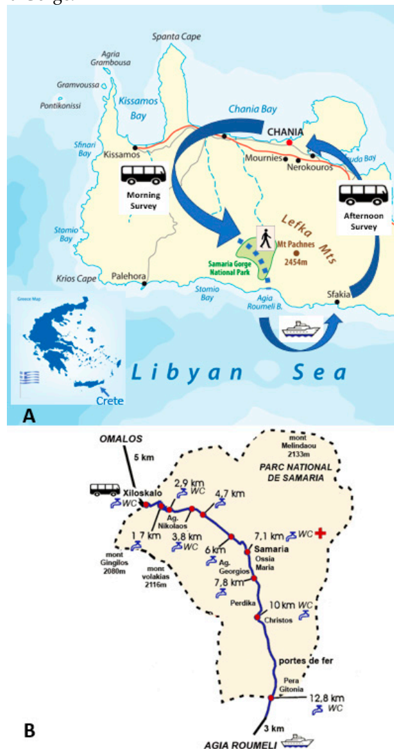
Figure 1. Schematic representation of the day tour and Samaria Gorge walk. (A) is adapted and used with permission from www.depositphotos.com . (B) is adapted and used with permission from Psarakis Travel Agency ( www.parakistravel.gr ).

Figure 1A schematizes the day tour of the participants. They were picked up at their accommodation between 06:15 and 06:45 in the morning. Participants had booked their day-excursion to the Samaria Gorge either from Chania ( n = 2 excursions), Rethymnon ( n = 4 excursions) or Herakleion ( n = 3 excursions). Depending on their city of residence, they arrived at the Samaria Gorge after a bus drive of approximately 2 to 3 hours: Chania (08:35), Rethymnon (09:00) or Herakleion (09:15). From Hora Sfakia, all busses returned to the participants’ accommodations in the afternoon at 18:00. Figure 1B shows the several resting locations where participants could drink water during the walk. These are simple tap points, as there are no inhabited villages or stores from which to buy refreshments in the Samaria Gorge.