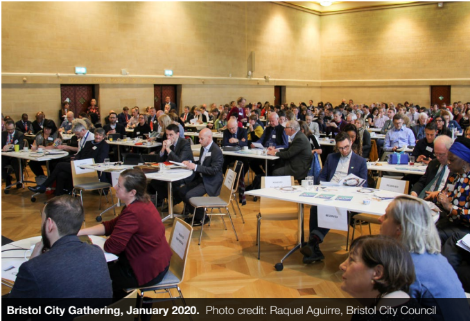
Bristol City Gathering, January 2020.