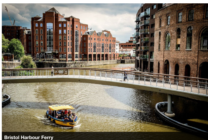
Bristol Harbour Ferry