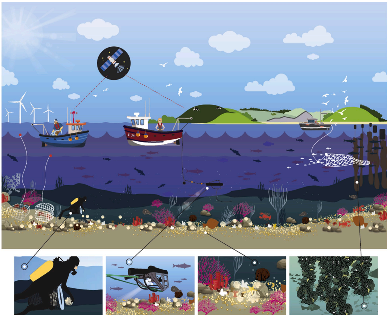
Fig. 1. Ambitious marine conservation 1) Reflects an ambition for sustainable livelihoods by fully integrating fisheries management with conservation (Ecosystem Based Fisheries Management) as the two are critically interdependent; 2) Establishes a world class and cost effective ecological and socio-economic monitoring and evaluation framework that includes the use of controls and Sentinel Sites to improve sustainability in marine management; 3) Requires a shift from managing individual marine features within MPAs to whole-sites to enable repair and renewal of marine systems; and 4) Challenges policy makers and practitioners to integrate MPAs into the wider seascape as critical functional components rather than a competing interest and move beyond MPAs as the only tool to underpin the benefits derived from marine ecosystems by identifying other effective area-based conservation measures (OECMs) to establish synergies with wider governance frameworks.

Within the EU Marine Strategy Framework Directive (Directive 2008/56/EC) sea-floor integrity is a descriptor used to assess Good Environmental Status [47]. Good Environmental Status is considered to be met when, ‘sea-floor integrity is at a level that ensures that the structure and functions of the ecosystems are safeguarded and benthic ecosystems, in particular, are not adversely affected’ [48].