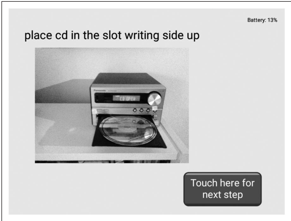
Figure 2. Example of a task step using text, audio and image prompts.

electronic voice). Participating dyads received weekly research phone calls (these did not discuss practical issues around the use of the toolkit) and were offered a help line number that they could use if they had questions or got into difficulty using the prompter and needed support to work out how to resolve problems in using it.