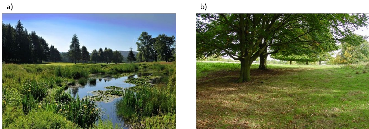
Figure 2. Example of images used in the Implicit Association Test (IAT). a) Greenspace with SuDS, and, b) greenspace without SuDS.

125 residents were surveyed in each location. This resulted in a final sample of 110 respondents for NGP and 83 respondents for Benton, with both tests fully completed and valid.