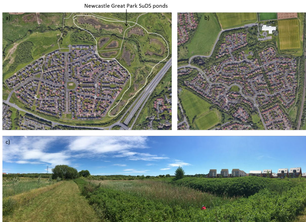
Figure 1. Sampling sites for Newcastle surveys. a) Newcastle Great Park (NGP; proximal to several SuDS ponds), b) residential area in Benton proximal to greenspace including the Northumbria University Coach Lane campus, and c) looking northeast over two of the NGP SuDS ponds.

recreational greenspace, including the Northumbria University Coach Lane campus, was selected as the no-SuDS sampling site (Figure 1b, Newcastle-upon-Tyne LSOA 007B).