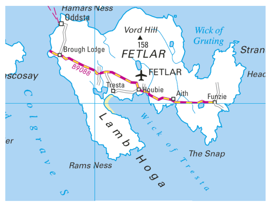
Map 1: Fetlar. The Funzie Girt curves round on a hillside on the west side of Vord Hill and peters out in the direction of Houbie.