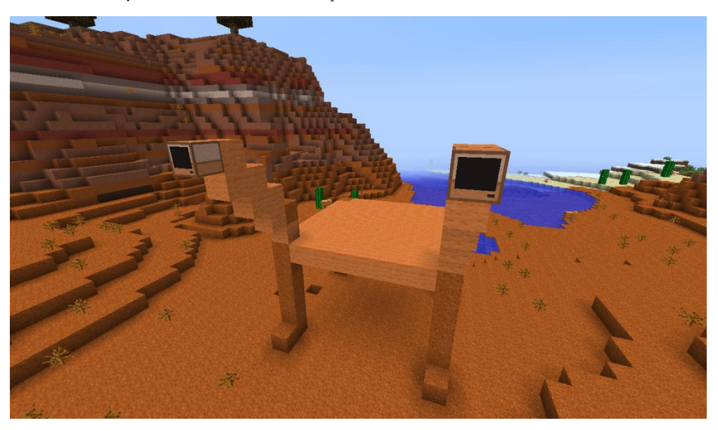
Figure 2. A crab built in Minecraft shows adaptations to its habitat. Its colouration camouflages it in relation to its surroundings, complex blocks represent compound eyes which enable efficient detection of motion and light and the eyes sit on stalks, giving a wide field of vision.

rainforest, and use knowledge of animal adaptations to habitats acquired in the introduction to either build an animal that would live in that environment, or design their own animal which is adapted to that environment. During this phase, they consider the habitat the animal should live in, living conditions of the habitat, and the animal's body shape, colouration and eye position ( Figure 2 ). Although children are building within a single biome, the processes involved in creating an adapted animal support consolidation and understanding of adaptations to other habitats that they have learnt about in the topic discussion.