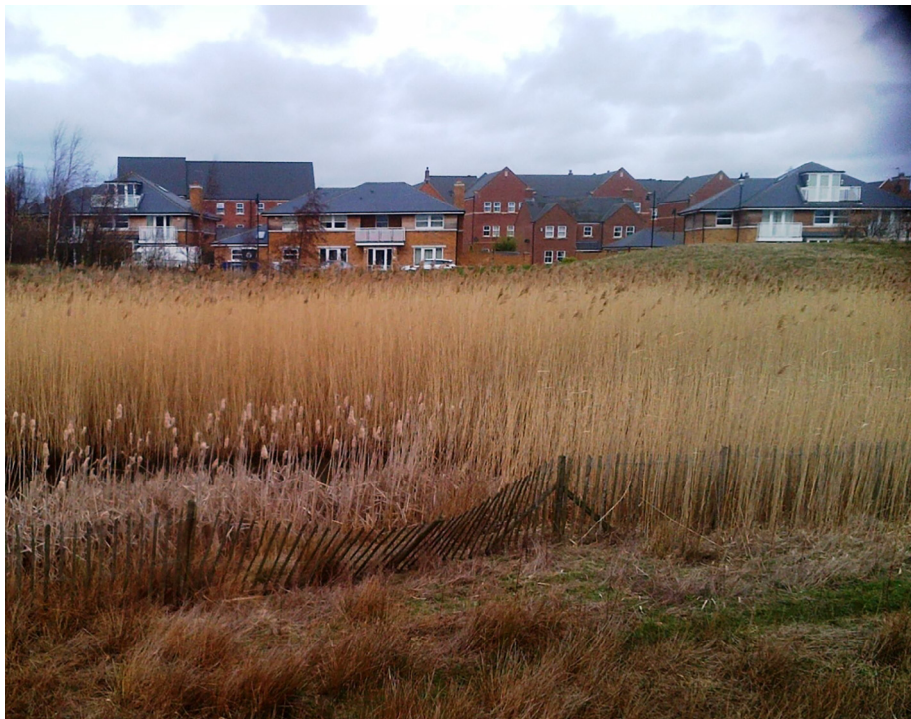
Fig. 1. Case study site 1, England: A SuDS retention pond close to a new housing development, planted with reeds to aid with the uptake and filtration of stormwater, foster biodiversity and provide amenity opportunities. (Credit: Jessica Lamond, 2017).

specified a priori as selection tick-boxes: Social activities (e.g. barbecues), Playing games, Exercise, Recreation, Relaxing and Dog-walking. A free-text “Other, please specify” box provided the opportunity to identify other practices.