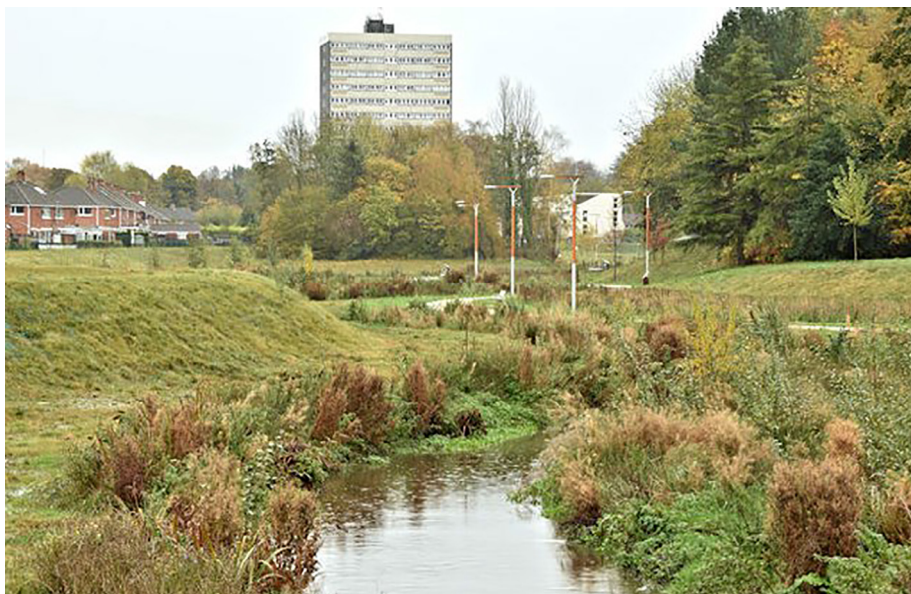
Fig. 2. Case study site 2, Northern Ireland: A renaturalised river flowing smoothly after heavy rain; the work is also designed to reconnect communities and restore the river as a community asset, as well as encouraging biodiversity. (Credit: Albert Bridge, 2015).

respondents’ practices in some way. A cluster analysis (Browne et al., 2014) was employed on the practice variables to categorise visitor-types. Analysis of Variance (ANOVA) (Strangor, 2004) was then performed between stewardship variables and practice category to determine if there were statistically significant differences in average willingness to engage in stewardship behaviour related to visitor-type. Finally, patterns between attitudes to BGI benefits and visitor-type were explored.