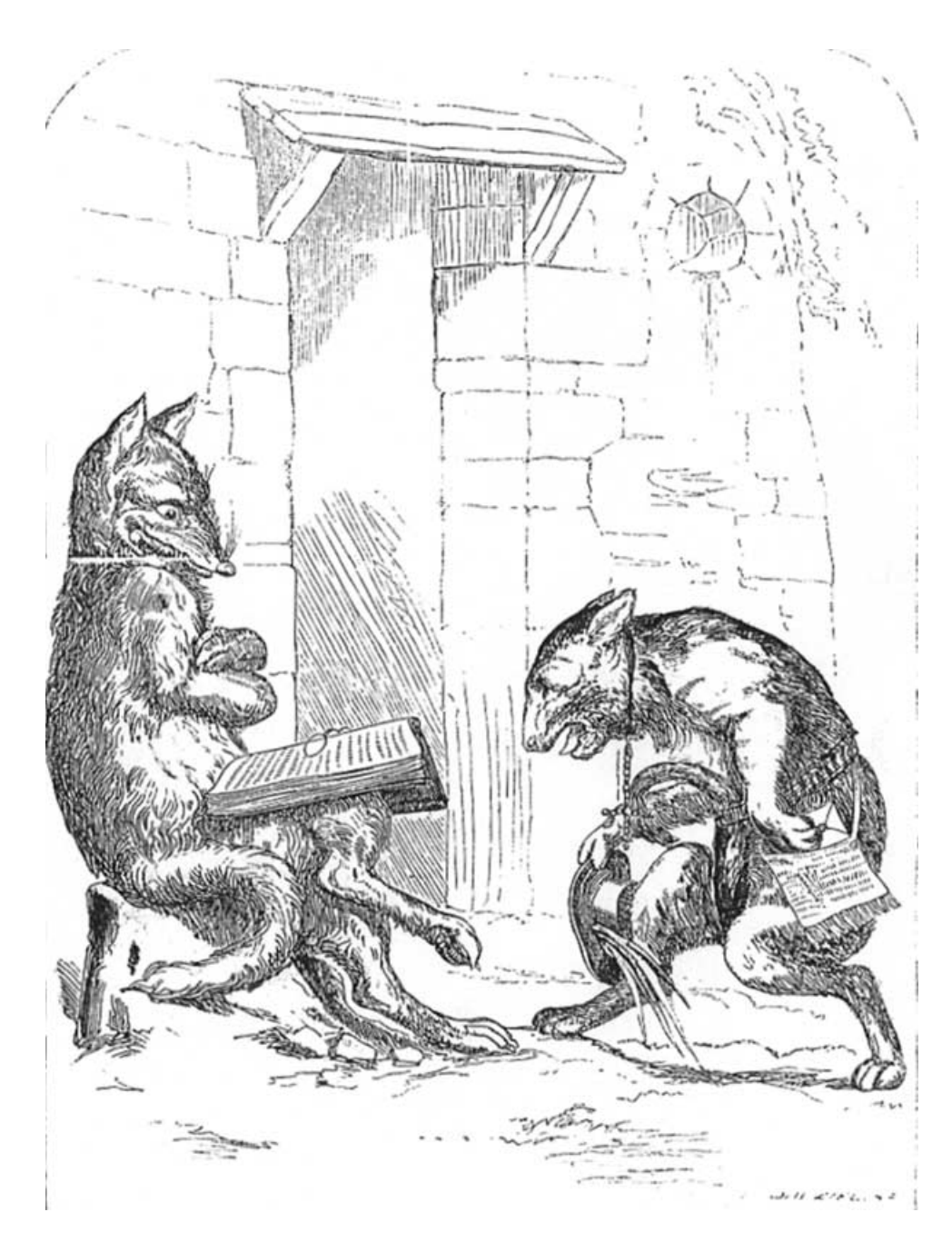
Figure 20. "Sir Tibert delivering the king's message." Illustration from The Comical Creatures from Wurtemberg; including the Story of Reynard the Fox with twenty illustrations drawn from the Stuffed Animals Contributed by Hermann Ploucquet of Stuttgart to the Great Exhibition (London: D. Brogue, 1851).