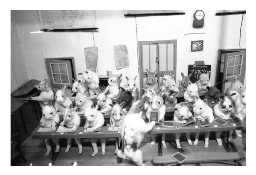
Figure 21. Walter Potter, "Rabbits' Village School," late nineteenth century. Taxidermy. Private collection.

on their slates; Potter produced a whole class of rabbits in a village schoolroom (Figure 21). His first tableau "The Death of Cock Robin," begun in 1854, includes ninety-six British birds. Other tableaux make use of large groups of guinea pigs, rats, squirrels, kittens, and rabbits – with between ten and twenty animals in each case.