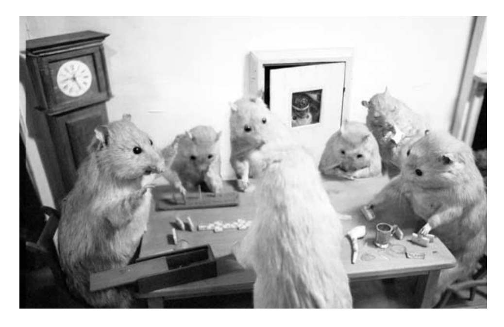
Figure 22. Walter Potter, "The Lower Five (The Rat's Den)," late nineteenth century. Taxidermy. Private collection.

Walter Potter has been grouped with Beatrix Potter, in the way he humanises animals by dressing them as people, and places them in human social situations (Blount 73). His anthropomorphism is certainly closer to hers than to Aesop's or Ploucquet's. But there are significant differences. In The Tale of Tom Kitten , Tom and his sisters are kept out of the sight of their mother's "fine company" because their mother is ashamed of their inability to conform to civilized/grown-up/human behaviour: they have dirtied and lost their clothes and had difficulty walking upright. In Potter's tableaux the kittens do not lapse into feline or childish behaviour because they are not kittens trying to be society ladies or wedding guests; they simply are. The fact that kittens are not adult animals, or that they are feline, has nothing to do with it. In some of Potter's larger tableaux, the creatures seem to simply function as dolls.