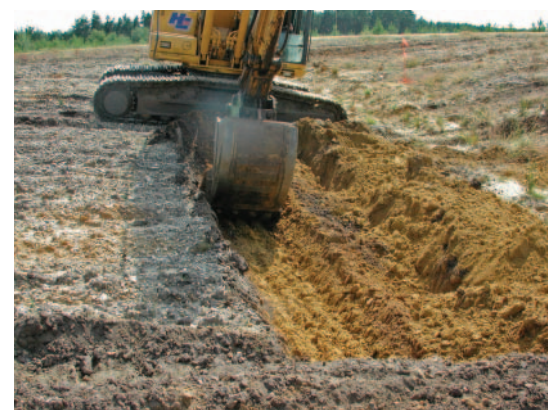
Figure 1 An excavator removing soil.