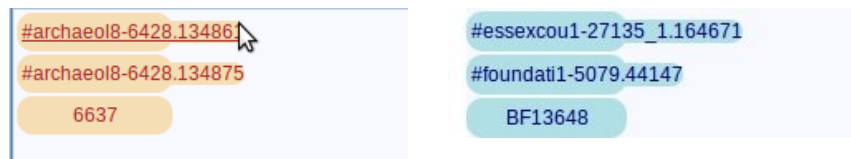
Fig 2. Search Results from the STAR demonstrator (prototype results list user interface)

The cross-search capability of the STAR demonstrator retrieves results from both datasets and grey literature reports (a variety of datasets for the hearth query). As seen above, the searches returned results for different annotation types (Contexts, Finds) and from different resources (grey literature resources commence with a hash bar in this interface). For example, the first search retrieves from Grey Literature #archaeol8-6428.134861 a Hearth containing a coin ; the original text was “ It differs from the other coin finds, however, in that it was associated with a hearth ”. Similarly the second search retrieves from Grey Literature an animal bone within a context of type pit ; the original text was “ the test pit produced a range of artefactual material which included animal bone (medium/large ungulate) ” . The semantic enrichment makes it possible for the STAR demonstrator to overcome lexical boundaries and to retrieve synonymous terms, as evident in the example of “ Animal Remains ” where the term “ Animal bone ” is retrieved.