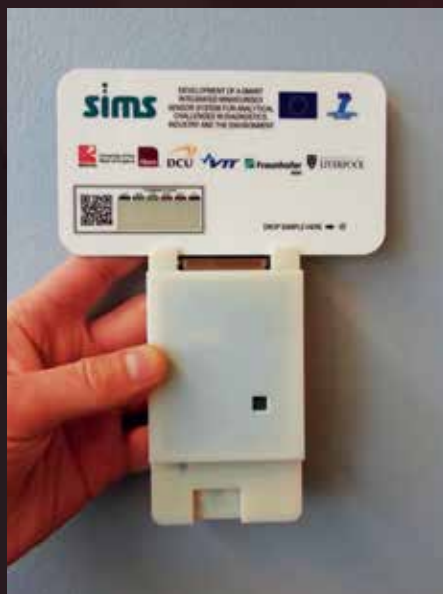
Current prototype of the SIMS device exhibited at LOPE-C in Munich, June 2013.

As the project advances, achievements may not be restricted to the measurement of cholesterol levels. Indeed, Killard foresees SIMS extending beyond its original aims and intentions: "SIMS will be most important in demonstrating what is possible with this type of technology, even if its application ends up being quite different to that envisaged here," he explains. "I could draw the analogy of the early personal digital assistants (PDAs) and smartphones that were revolutionised by Apple, not because they were especially technologically different, but because they had been more effectively targeted at the consumer. We will have to learn how to do that with organic and printed electronics technologies."