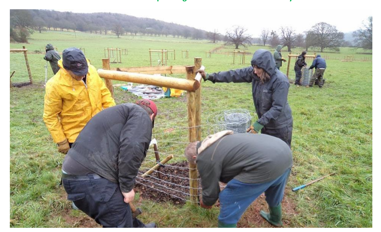
Photo: Volunteers learn about fruit tree planting with the National Trust at Tyntesfield