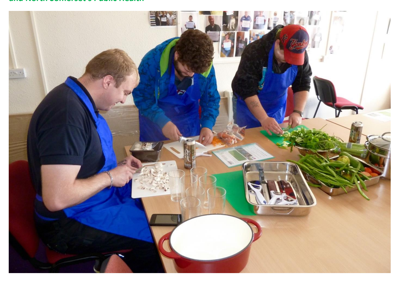
Photo: Participants in a Cooking Together course, a partnership project between Growing Together and North Somerset's Public Health