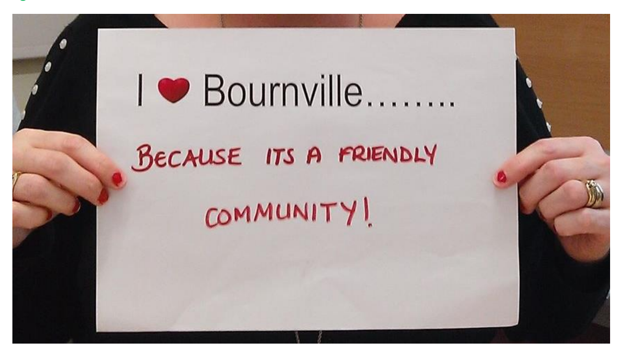
Photo: Bournville community consultation 2014 with Alliance Homes and other local partner agencies