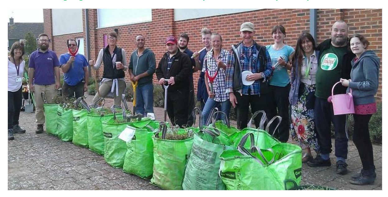
Photo: Growing Together volunteers and staff take part in a community clear up