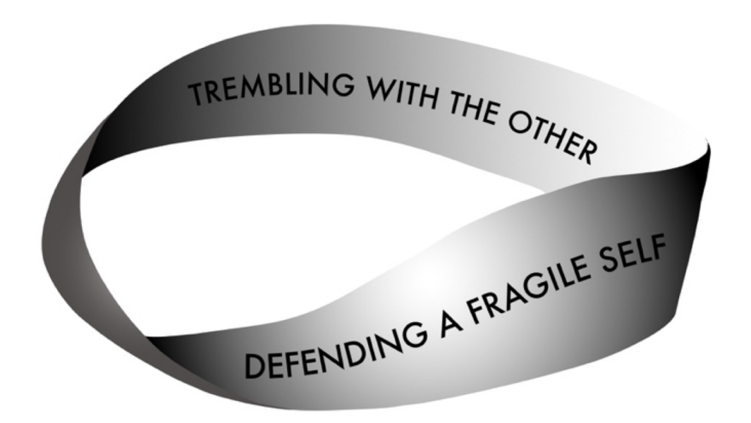
Figure 1-How empathy is constructed by therapists who practice mindfulness.