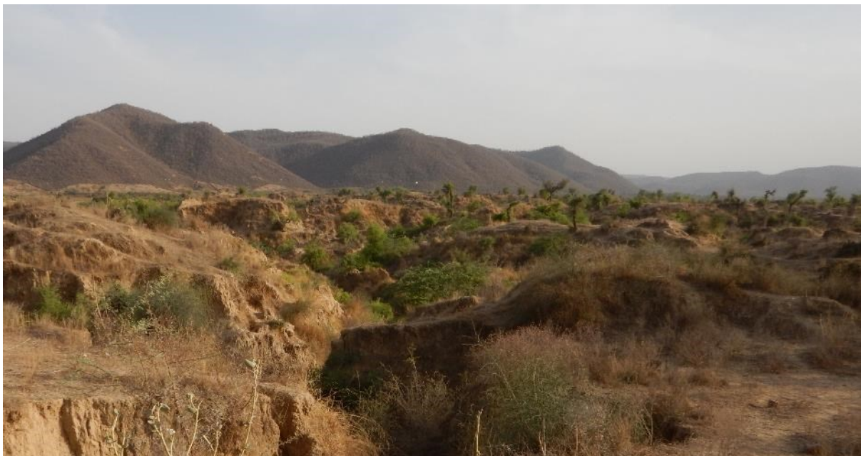
Figure 3: Complex ravine habitat structure bordering an unconverted reach of the Banas River. Low resolution image only inserted here to aid reviewers

Changes in vegetation directly or indirectly due to human activities also create pressures on ecosystem integrity, ecosystem services and utility for both people and wildlife. Dikhni babul ( Prosopis juliflora ), also known as ganda babul ('wild babul' in Hindi) and in its native South America as mesquite, is a thorny tree of the family Fabaceae and sub-family Mimosoideae. The tree is native to Mexico, Central and northern South America, though now naturalised and frequently invasive in the Indian Sub-continent as well as in parts of Australia, Brazil (beyond its native range), Africa, western Asia, Arabia and Hawaii (BioNET-EAFRINET, undated). P. juliflora was first introduced to India in 1877, since becoming invasive and widely exploited