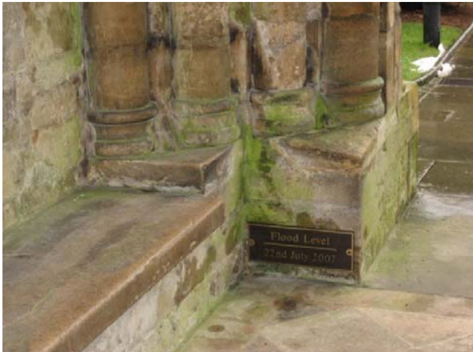
Figure 3. Setting 1 Abbey Flood Level 2007 Official Mark. Dated 22 July 2007.