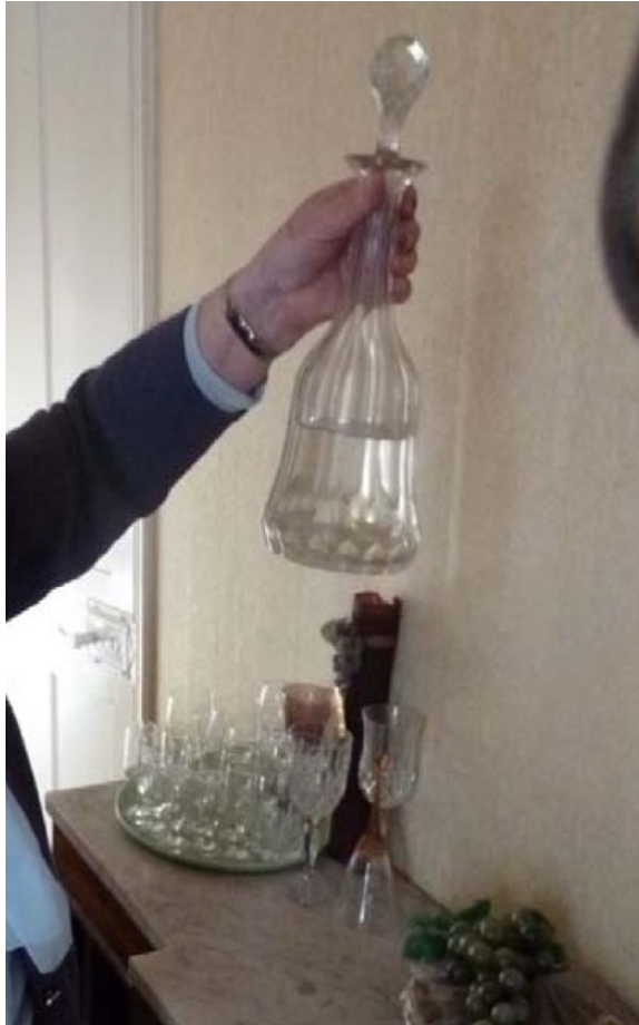
Figure 2. Floodwater in a decanter.

Source: Andrew Holmes. Published with permission.