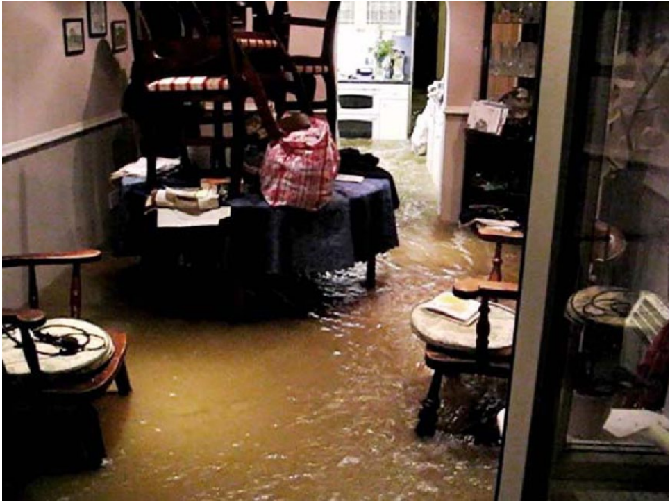
Figure 6. Screen capture from a home video, July 2007: floodwater surges through the kitchen and living room of his (Setting 1) house.