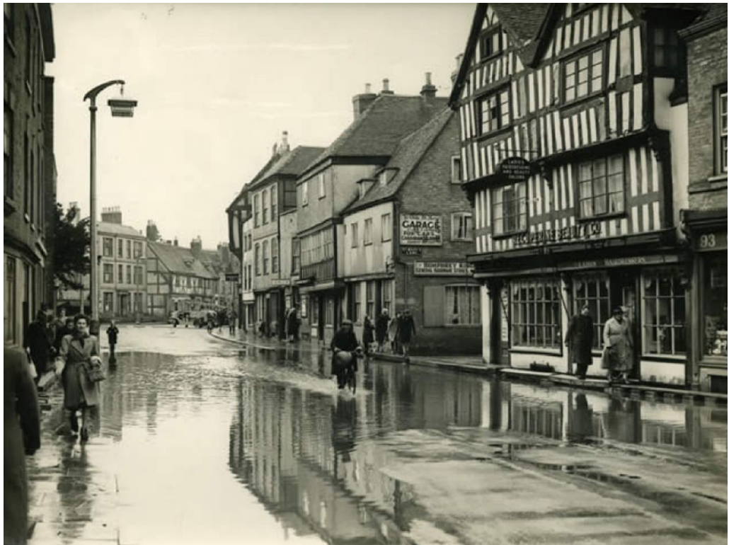
Figure 1. A photograph of the 1947 floods in (Setting 1).