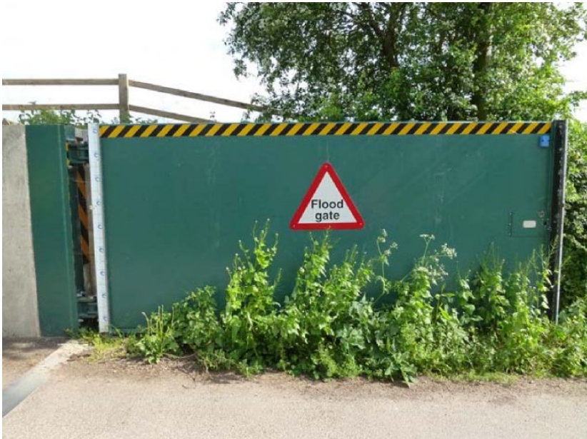
Figure 5. Photo of a flood defence system implemented after the 2007 floods. Source: Joanne Garde-Hansen. Published with permission.