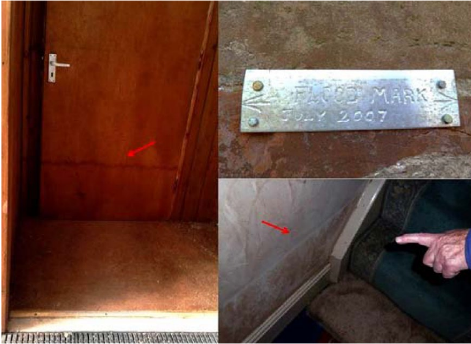
Figure 4. Unofficial flood marks of residents inside and outside their homes and gardens.