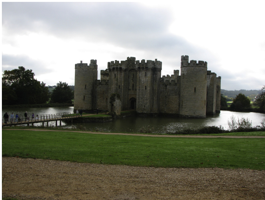
Fig. 1. Bodiam castle, East Sussex England (Photo: Author).