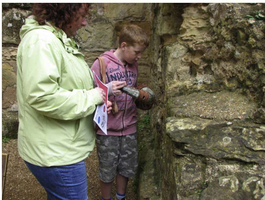
Fig. 2. Visitors playing A Knight's Peril at Bodiam Castle. The child is holding an echo horn.