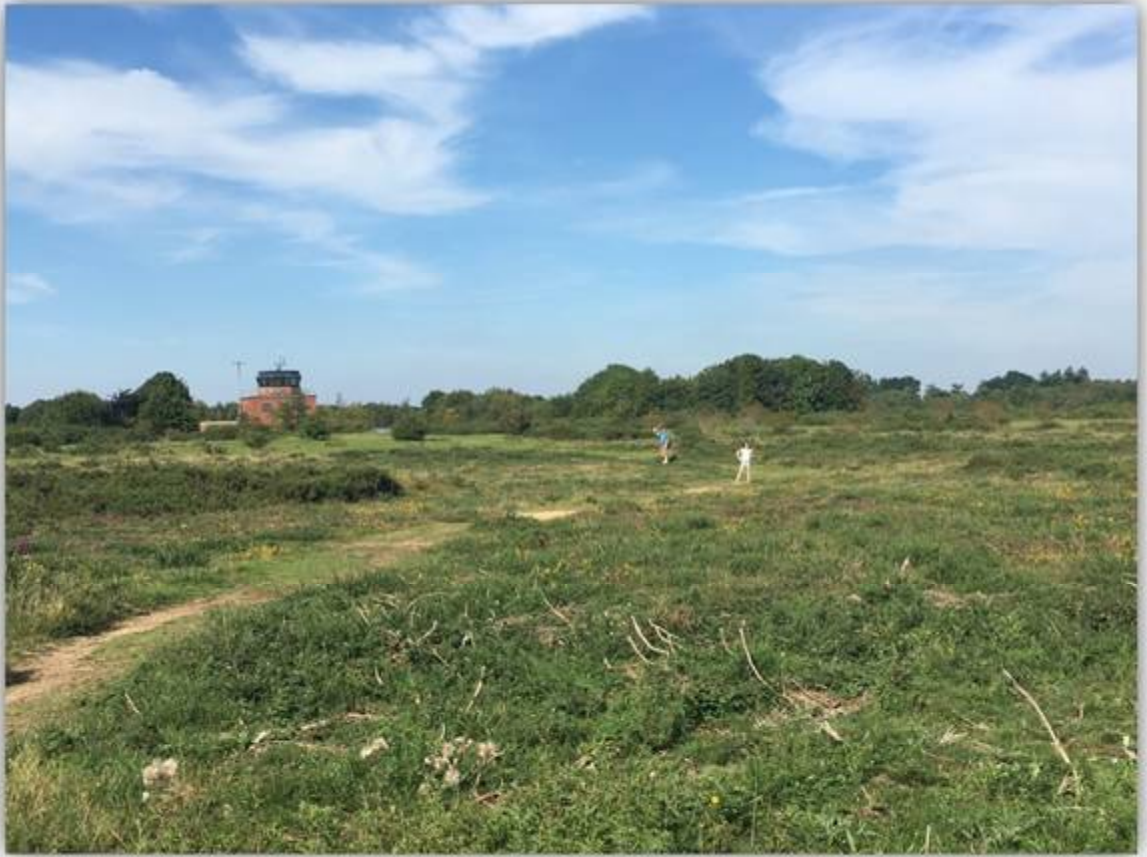
Photograph: 'Greenham Today'. 1