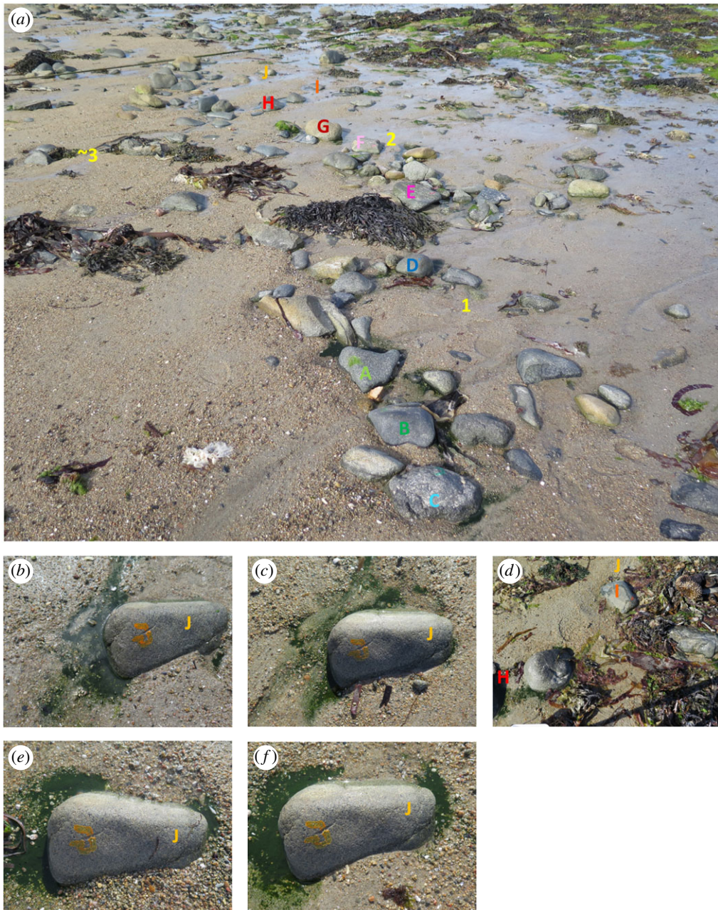
Figure 1. The boulders used for sampling. (a) An overview of all 10 individually marked boulders (A–J) on the beach on 13 June 2017, 112 min after low tide; the letter colours correspond to the colour of the varnish used to mark the respective boulder; the yellow numbers 1–3 indicate the positions of the observed circular mills; the patches of S. roscoffensis can be seen clearly around the proximate boulders, A–C, but all boulders had worm patches around them on each of the 5 days of observation. The five photographs of boulder J. (b) 10 June, 15.45 (95 min after low tide). (c) 11 June, 17.24 (164 min). (d) 12 June, 17.25 (125 min), boulder J was completely covered by seaweed and was not visible, it is in the area marked with J north of boulder I, which is in the field of view together with part of boulder H. (e) 13 June, 17.28 (98 min). (f) 14 June, 16.46 (26 min), note the difference between 13 and 14 June in the sand composition to the south of the boulder.

Over the 5 days, we observed altogether four circular mills. Numbers 1 and 2 were photographed and filmed on 10 June during the sampling of the transect between 15.00 and 15.45 close to boulders D and F, respectively (figure 2 a,b ; electronic supplementary material, videos S1 and S2). We encountered number 3 by chance on 14 June at 13.30 (before the sampling period from 16.30 to 16.45) approximately 2 m up the beach from boulder H (figure 2 c ) while collecting seawater and worms for another study and returned immediately to photograph and film it. The two twins in this mill (figure 2 c ; electronic supplementary