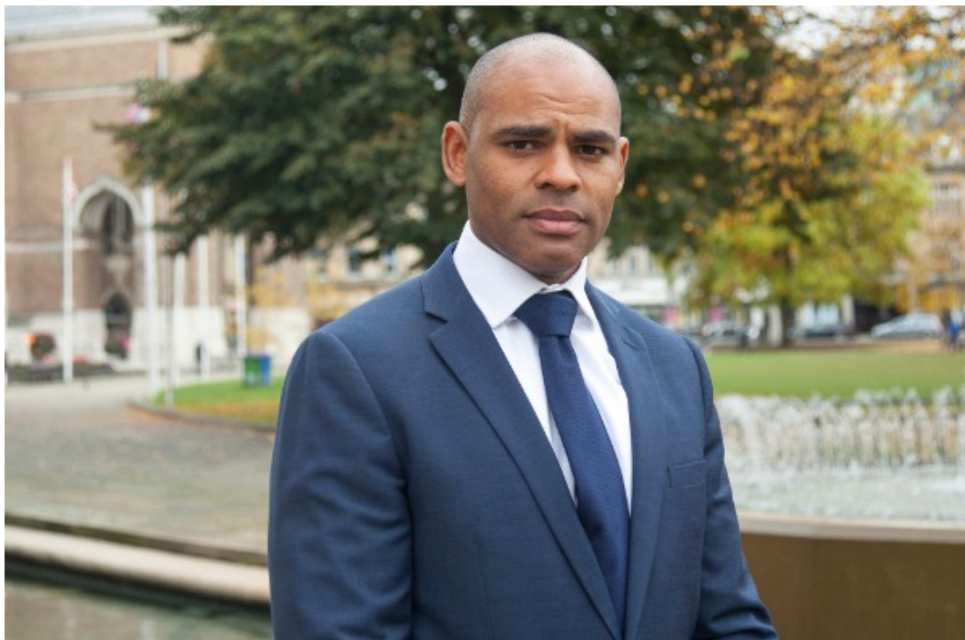
Figure 2. Marvin Rees, mayor of Bristol

In the May 2016 election, Rees, a young and charismatic candidate, delivered an emphatic victory for the Labour Party. Rees, who is mixed-race and was brought up in the less well-off parts of Bristol, is strongly committed to reducing inequality in the city. On election, he immediately attracted national media attention, partly because he was the first non-white political leader of the city of Bristol, a city that played a prominent role in the transatlantic slave trade.